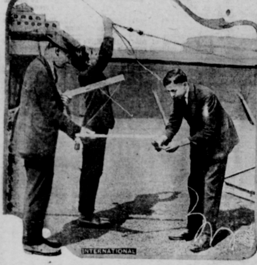
Amateur Radio Operators Erecting Acrial on the Hoof.

F.O.B. DETROIT NEW PRICE You have never before had the opportunity of securing as much motor car value at so low a price. Take advantage of this opportunity and place your order now when you can obtain prompt delivery. Terms if desired SLATON MOTOR CO.