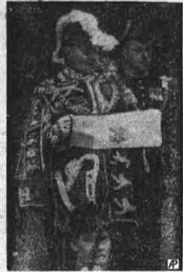
ENTER EDWARD Edward was proclaimed king at the death of his father on January 20, 1936. As prince, he showed playboy tendencies.