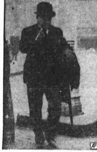
THE CABINET PONDERS No longer able to ignore the king's "private" life, cabinet worried about it. Chief worrier, Prime Minister Baldwin (above).