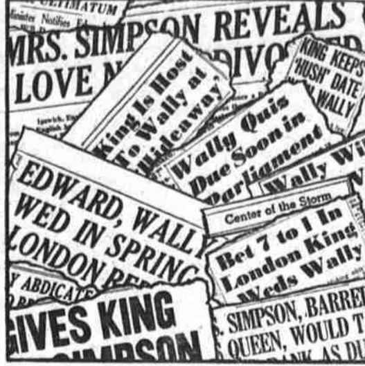
AMERICA EATS IT UP Not so the U. S. press. Headlines got bigger and bigger. Mrs. Simpson was the woman-of-the-year, and British officialdom saw headaches coming.