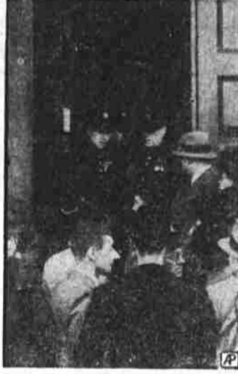
SHE GETS A DIVORCE When "Wally" got her second divorce, U. S. reporters made up most of the crowd outside the court. U. S. press played it big.