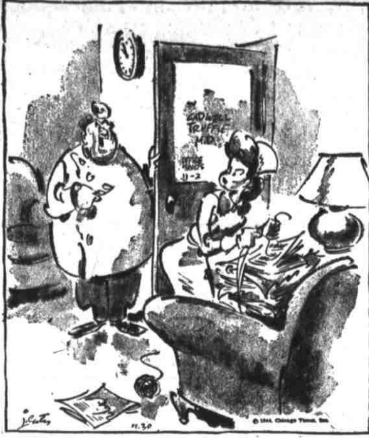
"I realize the need for waste paper salvage, Miss Sneed, but without those old magazines in the office people will consider me a charlatan—a quack!"