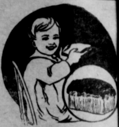
SPREAD WITH COUNTRY BUTTER

HARRISON BROS., Proprs. One Block Northwest of the Squa