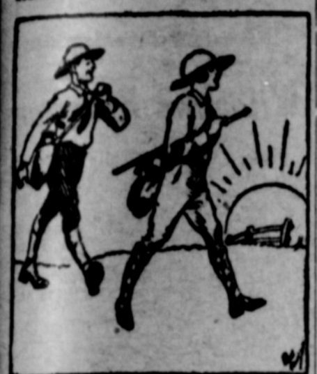
"Best Walkers Make Best Citizens," Saye Mayor of New York.

New York .- One must walk nowe bys to be in the swim. Statistics ned from the out-door departments the newspapers, from the Boy Scout of Campare Girls' organizations, on the Y. M. C. A. branches and sadred bodies, from scores of amateur feelers in sporting goods, indicate that