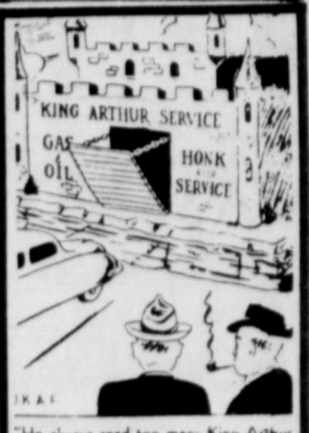
"He always read too many King Arthur stories." You might read about our type of service in story books - it's that amazing-but we're wide-open when you want to drive in. Give us a trial-soon.

you would not like to be a news reporter, how about calling me your news, anyway. My number is still 996-2423 and you will find me at home most any day after 4:30. Or drop by the Post Office and give me your news. I would love to write a good column for this community but cannot do it without YOUR help.