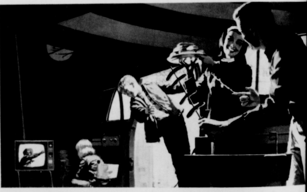
Today, abundant electric service brings modern conveniences to the campsite.

117 N... Phone Y... OF THE CO... THE WORLD'S... PROVIDED... Natural Gas... Buy 1 Y... of Fried... $1.00, a... this Couj... MC... 11:... Home... FRIE... Resta... PER... N... W... ANNIVE... WELCON... OCCASIO... Also:... and Gues... The