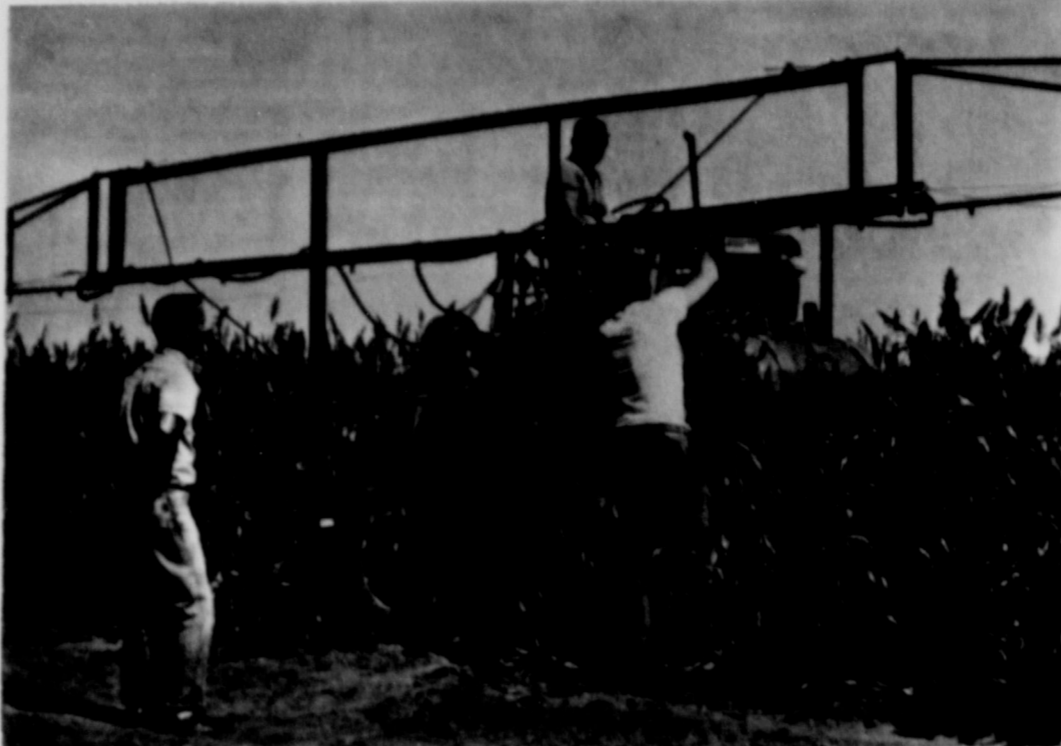
DRYING PROCESS — The hybrid sudan is killed by spraying in order to reduce the moisture content. The moisture must be approximately 13 percent before the crop can be harvested.

pinched off the cattle trails, Tascosa's life blood, and sealed the fate of the settlement. Today, only the town's stone court house and Boot Hill remain.