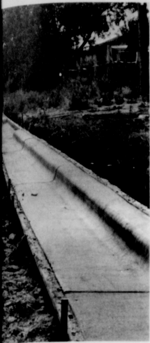
WORK GOES IN — Slaton's big 1965 program is currently underway and progress of schedule, according to city officials, is a view down one of the 80 blocks to where workmen put finishing touches.

Visit Slaton Lumber's new homes Sunday, 2 to 6 p.m. (adv.)