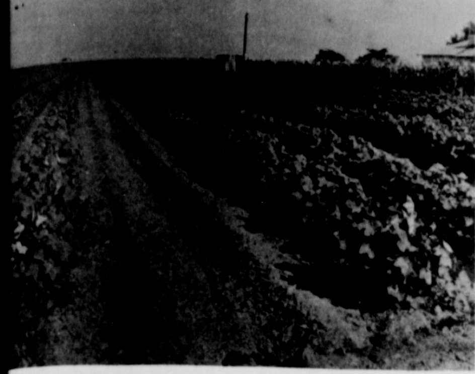
TON ON THE GROW — Cotton around Slaton are showing real prospects, on the whole, but more moisture is needed by many farmers. Spotted rains have been ample in spots but lacking in other areas.