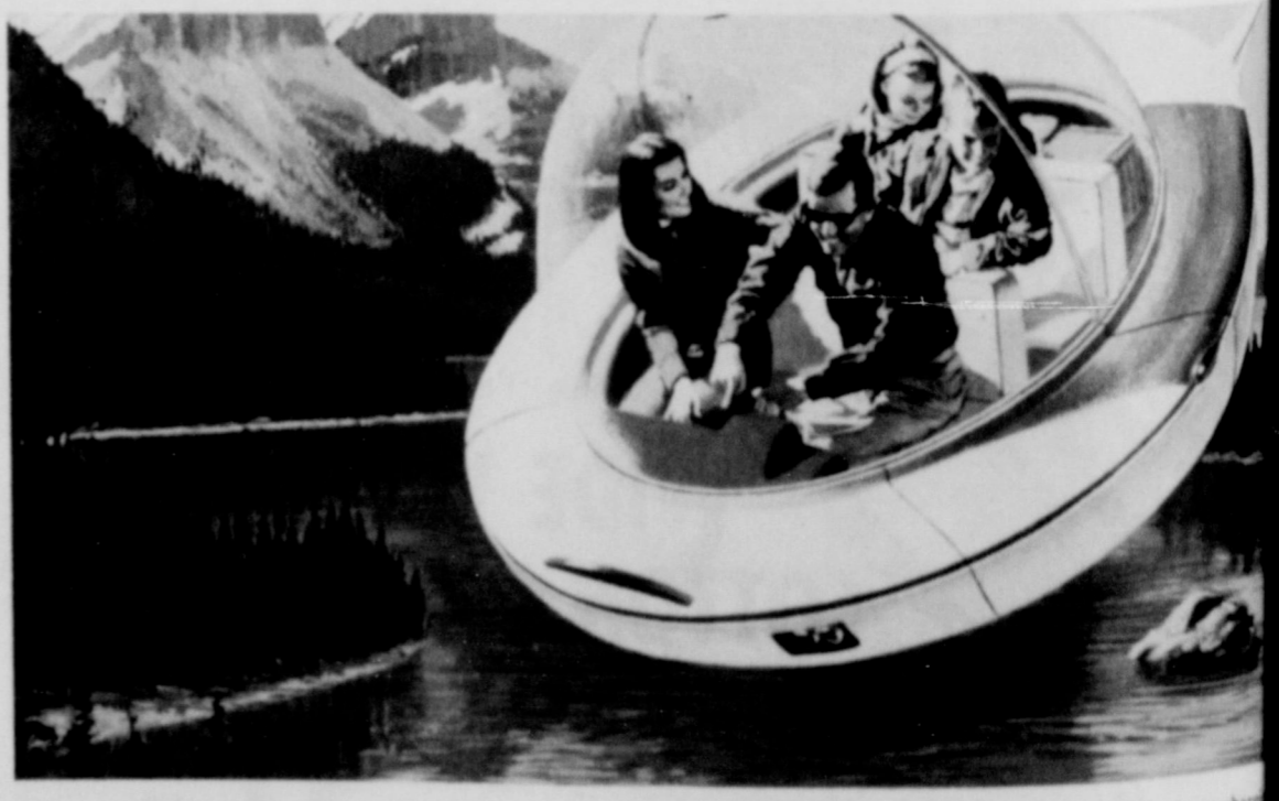
Flying mobile camper of the future may be electric powered--plugging into any electric outlet for rechar...