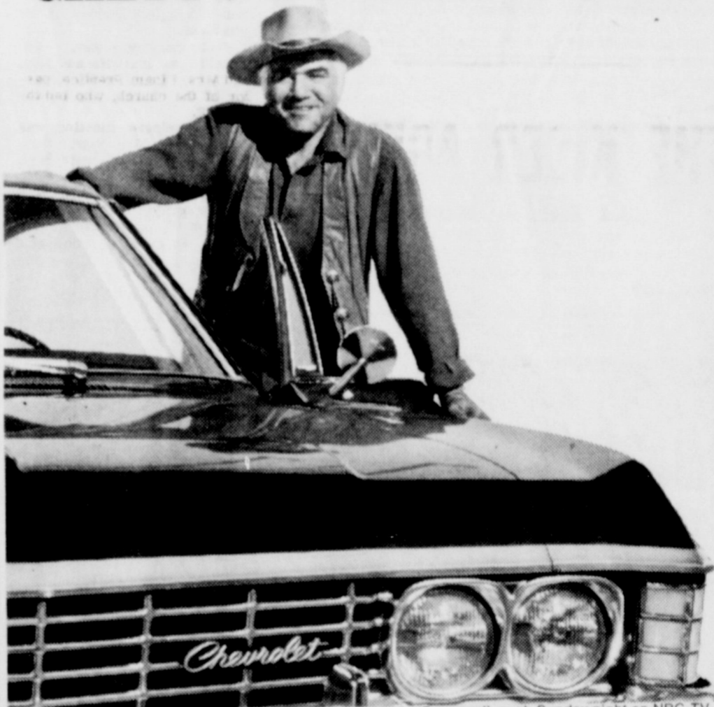
Watch Lorne Greene, star of Chevrolet's "Bonanza", each Sunday night on NBC-TV.