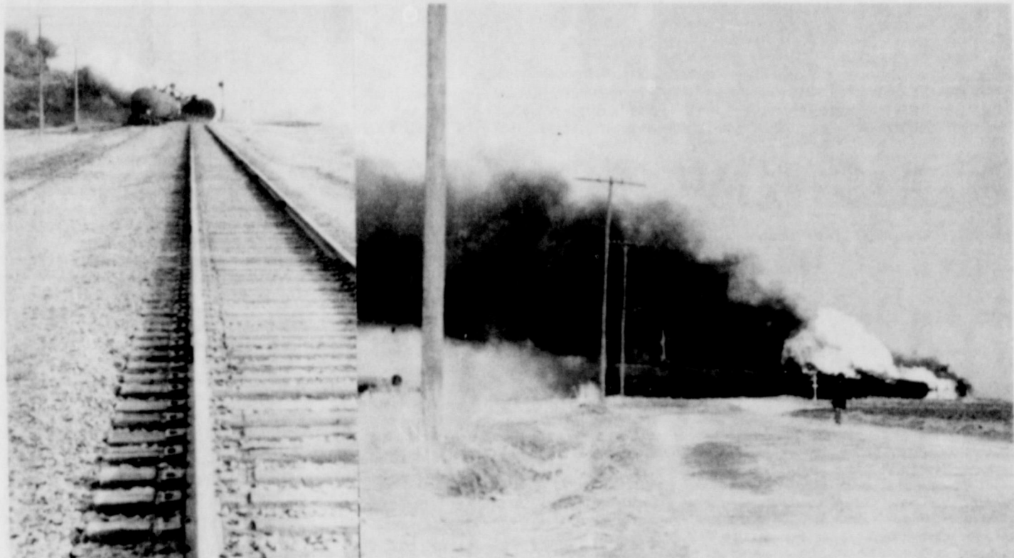
TRAIN FIRE, EXPLOSION SCENE--These two photos show the burning tank cars which derailed at Southland Friday afternoon about 3:15 p.m. At left, tank cars can be seen on the Southland siding and over on the main track. At right is a scene from