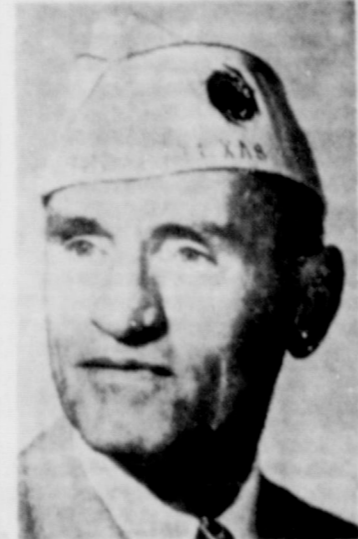
E. L. "STONEWALL" JACKSON

Once nematodes get at your cotton, yields go down and so do profits. But with FUMAZONE 86 soil fumigant applied at only 1 to 2 gallons overall an acre, you can take care of root-knot, sting, meadow and other nematodes--those microscopic, worm-like soil pests that attack plant roots, suck away profits. FUMAZONE 86 soil fumigant increases yields up to 1/2 bale an acre. Many High Plains farmers just like yourself tell us that's exactly what happened to their yields after their soils were treated with FUMAZONE 86. It can be applied right from the drum. No