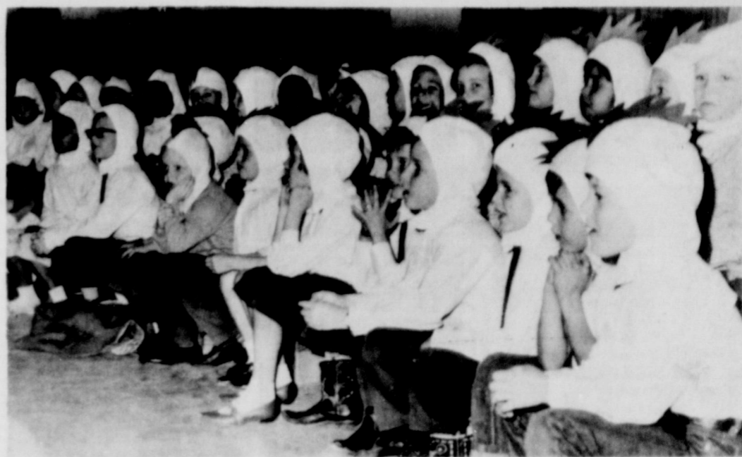
WAITING TO PERFORM--This group of "chickens" were just waiting to sing at the musical presented by students from West Ward Elementary last Thursday night. They are all first graders.