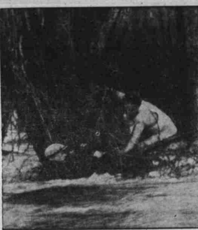
Rescue scenes such as this were re-enacted throughout the Northeast this week, as floods ravaged wide areas. This dramatic picture shows Nelson Campbell, 66, who was swept from a bridge by flood waters, getting a helping hand from Allen Decar, school bus driver, Decar, however, fell into the swift current, but both were saved by a rescue party.