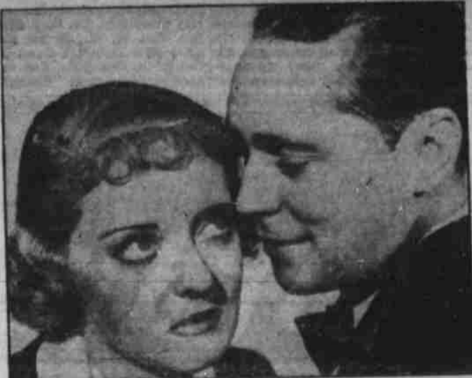
Betty Davis and Franchot Tone as they appear in "Dangerous," at the Ritz Friday and Saturday. Her work in this picture won for Miss Davis the Motion Picture Academy award for 1935.