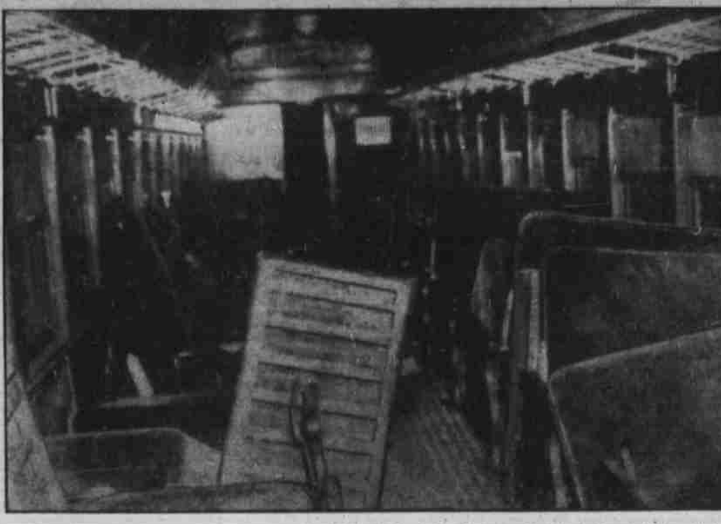
Screams of injured passengers, who wakened on their night ride on a Reading railroad train midst a mass of wreckage, brought terror to this scene. Railroad officials said a broken rail caused the locomotive to rip off two spans of the Susquehanna river bridge near Sunbury, Pa., and drop 30 feet into a canal. Four were killed, 31 injured. Above, interior of one of the battered coaches.