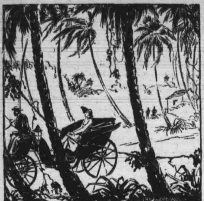
Allaire investigated the nearby villages.

laire, take care of yourself. Don't," he grinned briefly, "wait up