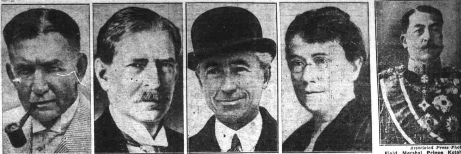
Mary Emma Woolley, president of Mt. Holyoke college, was named as a delegate to represent the United States at the Geneva arms conference. Never before has any woman served as a delegate to such an important international conference. Other members of the American delegation (left to right): Ambassador Charles G. Dawes, head of the group; Senator Claude A. Swanson of Virginia and Ambassador Hugh Gibson.