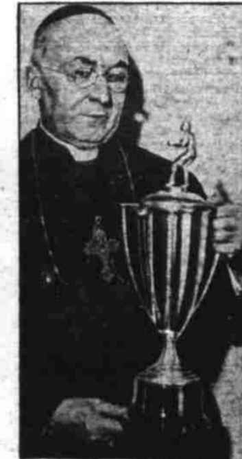
George Cardinal Mundelein, archbishop of Chicago, declares competitive sports promoted by organizations within and without the church do much to aid the country's youth.