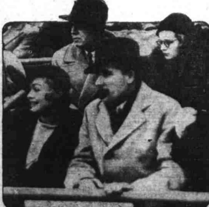
Joan Bennett of the films, whose engagement was recently announced, is shown with her fiancé, Gene Markey, author and scenarist, at a polo game near Los Angeles. Seated in front of them is Miss Bennett's sister, Constance, and her new husband, the Marquis De La Feltre.