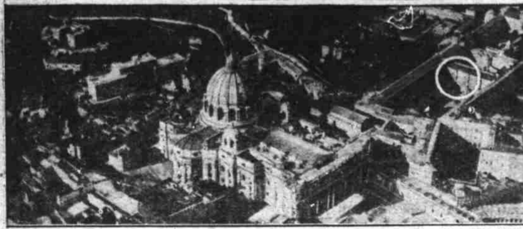
The roof of one of the wings of the Vatican library, built in 1588, collapsed killing an Italian attorney and two workmen. Two other workmen were believed to have been caught in the collapse. Above is the Sistine gallery of the library which was damaged along with priceless literary and art treasures of the ages. Below is a view of St. Peter's, Vatican City, showing wing of Vatican library (circle) where roof fell in.