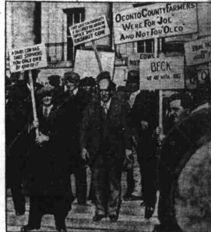
Above are shown the banner-carriers of a group of 1,000 Wisconsin dairy farmers who stormed the state capitol at Madison in an anti-oleomargarine demonstration. While they were there the state senate passed a law placing a tax of six cents a pound on oleo sales.