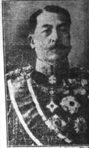
Field Marshal Prince Kotshita Kanin (above), kinsman of Emperor Hirohito, is the new chief of the general staff of the Japanese army.