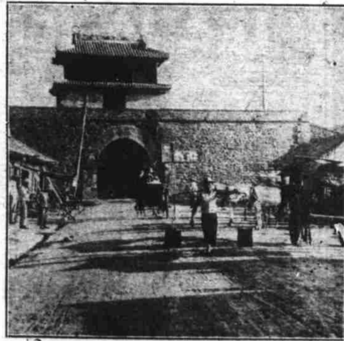
A street in Chinchow behind the great wall of China where the fast organized force of Chinese troops in Manchuria is concentrated. Japanese commander warned China to withdraw her troops from the city. Japanese forces moved toward Chinchow ostensibly to clean out lawless elements along the South Manchurian railway.