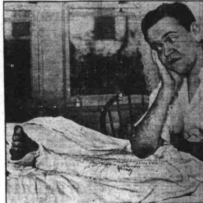
Lloyd Hamilton, screen comedian, he of the "Salome hips," makes good use of the plaster casts housing his legs. He broke his left leg in an auto accident, and the first day out of the hospital his crutch slipped on a polished floor and his other leg was broken. Now all his visitors in the hospital contribute their autographs to his "album."