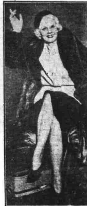
Jean Harlow, platinum-haired film actress, had an enthusiastic greeting for New York when she arrived for the Christmas holidays.