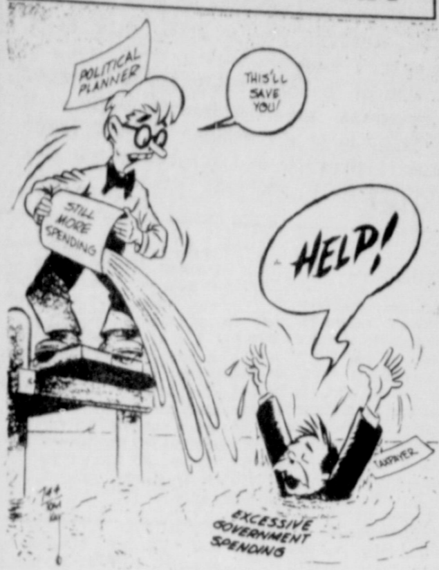
Hasn't Worked Yet