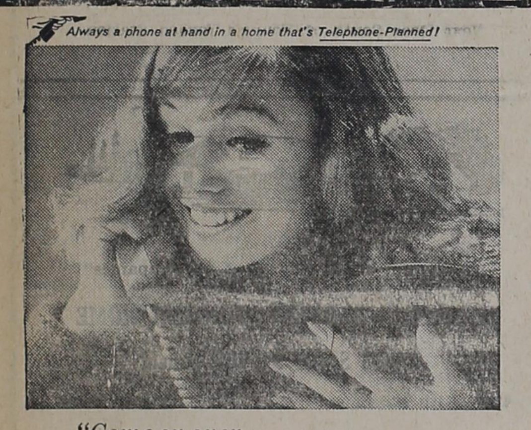
"Come on overthe whole crowd's coming!"

Another fun time in the playroom - the center of family relaxation. Why not have a phone within easy reach of your fun? A color extension in your den or family room - in your choice of ten delightful colors-costs so little.