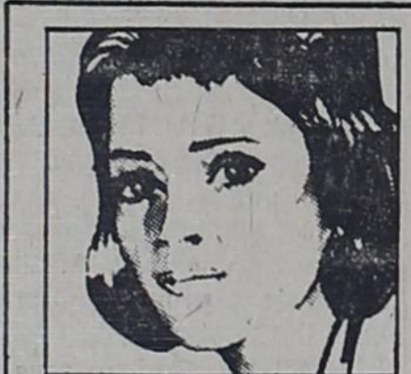
When you're not like yourself, Lydia Pinkham understands