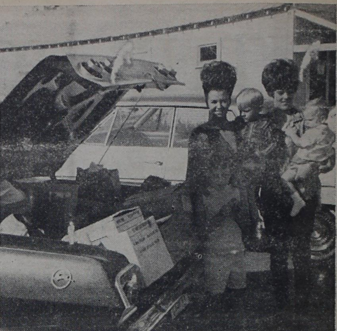
Pictured above are members of the Ropes Young Homemakers as they prepare the many different items they collected to be sent to victims of recent Hurricane Beulah in South Texas.

Other people's dogs should not be in your yard, but every now and then a dog does get loose and roam until it's concerned owners find him. We have had this happen at our house a few times and been very upset until he was located. You surely have not been around any children when they have lost their pet, especially through the