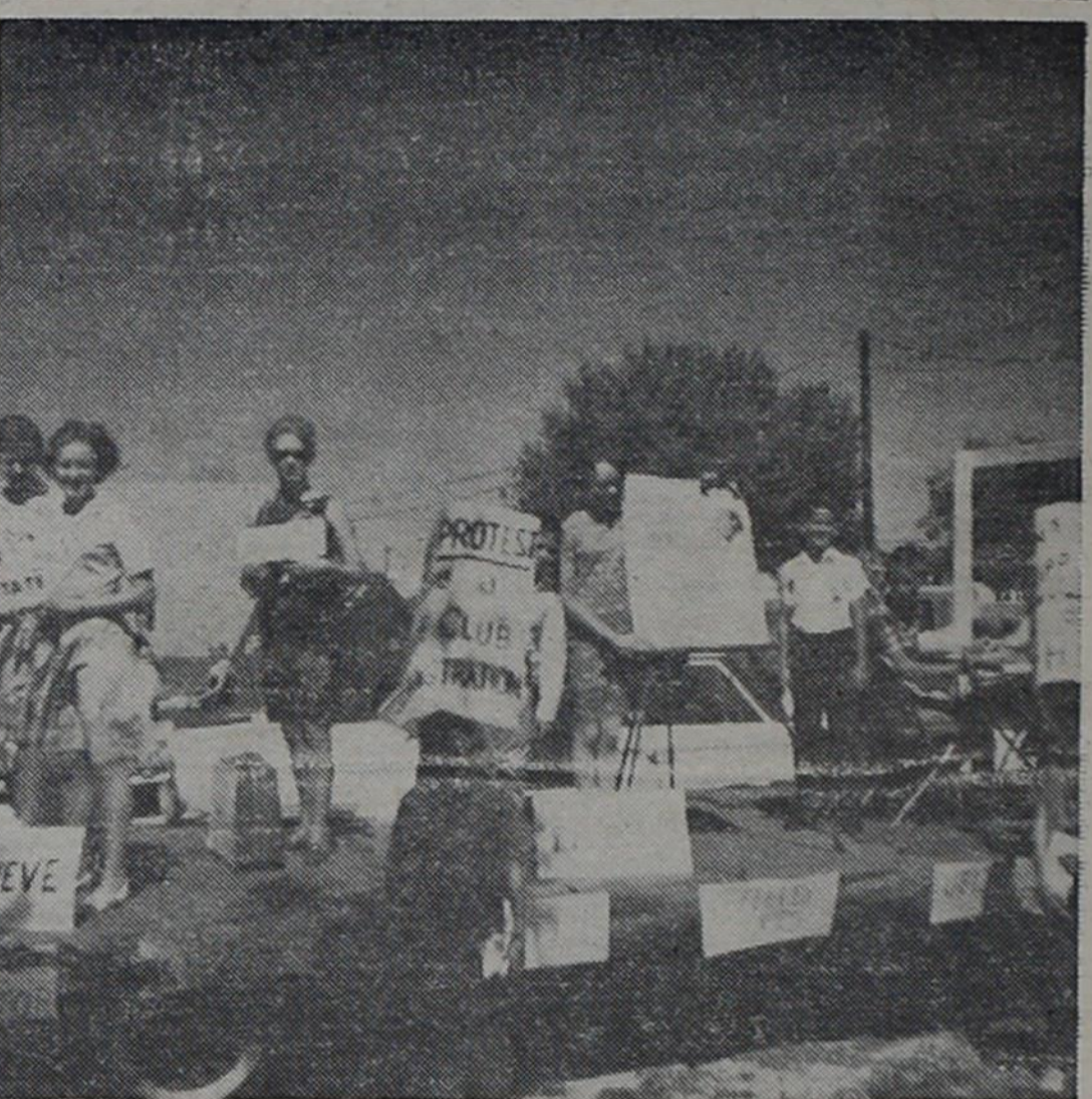
Pictured above are members of the Ropes Starlight 4-H Club and the float they made and entered in the 4-H parade held recently in Levelland to help promote 4-H Week.