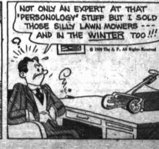
by Fred Loche