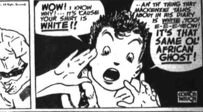
There's Always An Argument