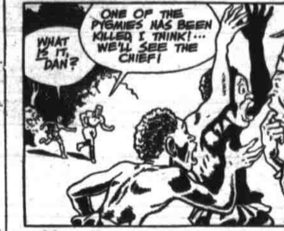
MR. AND MRS.