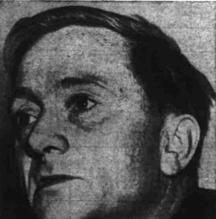
WILLIAM O. DOUGLAS: Indifferent to the sartorial graces.