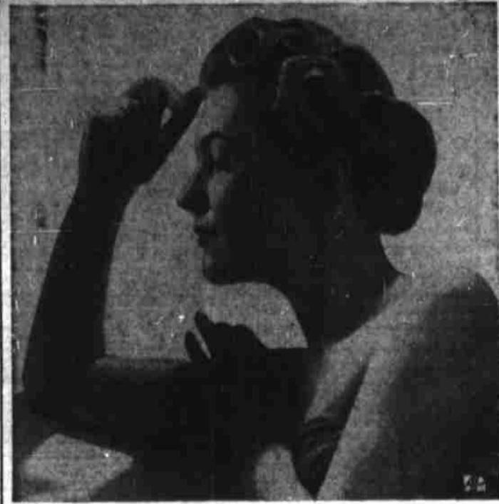
The hair is waved and swirled away from the neat, regular hairline in this smart Easter coiffure.

By BETTY CLARKE AP Feature Service Writer When the hairline is good it is very, very good—but when it is bad it is horrid.