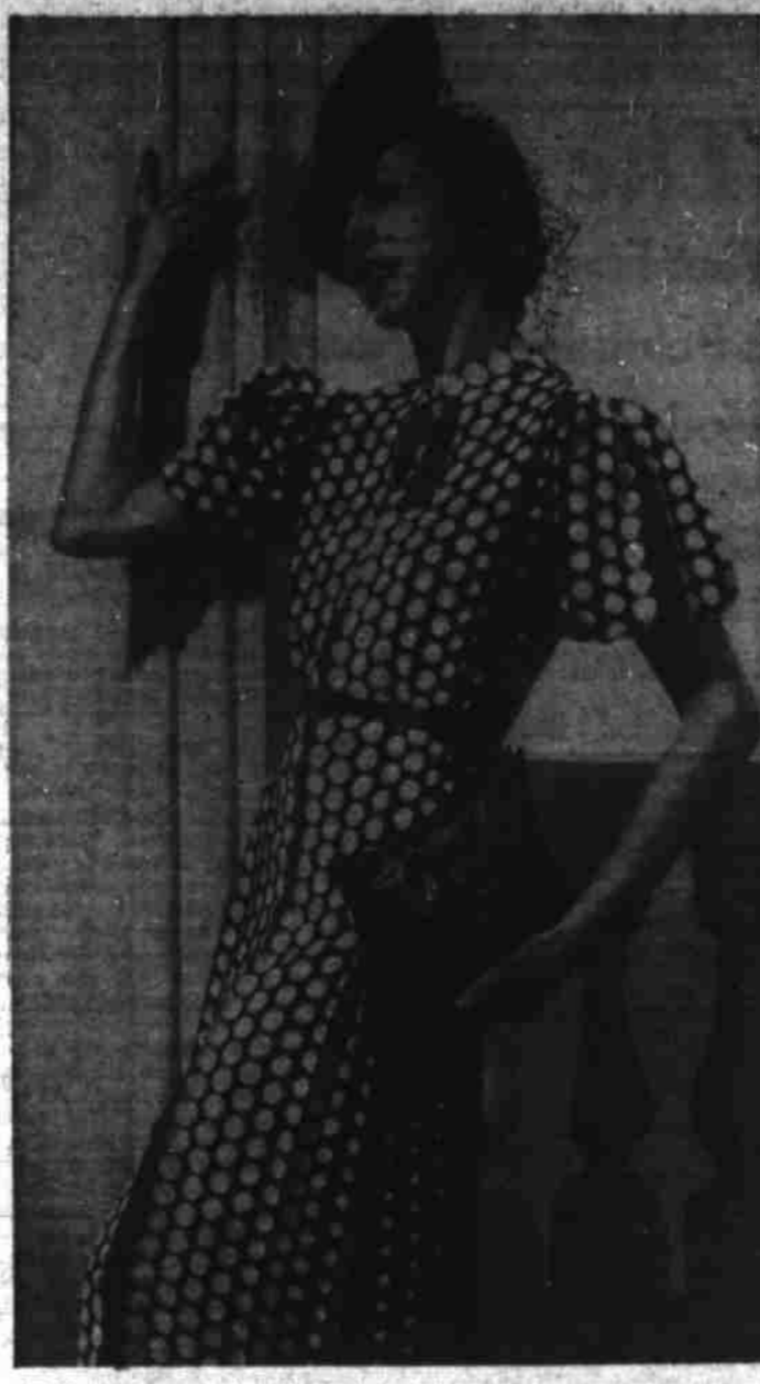
Polka dots are news this spring. Here you see white ones, shading from plaid to 25-cent-pleco size scattered thickly on a navy blue crepe ground. The large ones meet a rosy red panel in the front of the frock and on the sleeves. Design by Gaston of Paris.

Suits To The Fore Once more suits stand in the forefront. They are soft this year and greatly varied in design. The newest version links a sheer wool frock to a short fitted jacket of the same material (the schoolgirl look). Tailleurs are made of pin-