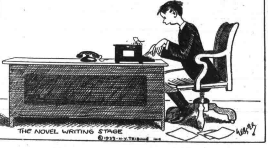
THE NOVEL WRITING STAGE

Chapter I Dick Trelamy swung himself in to the saddle put his paws to his noble steed and galloped down the road towards the red dog tavern.