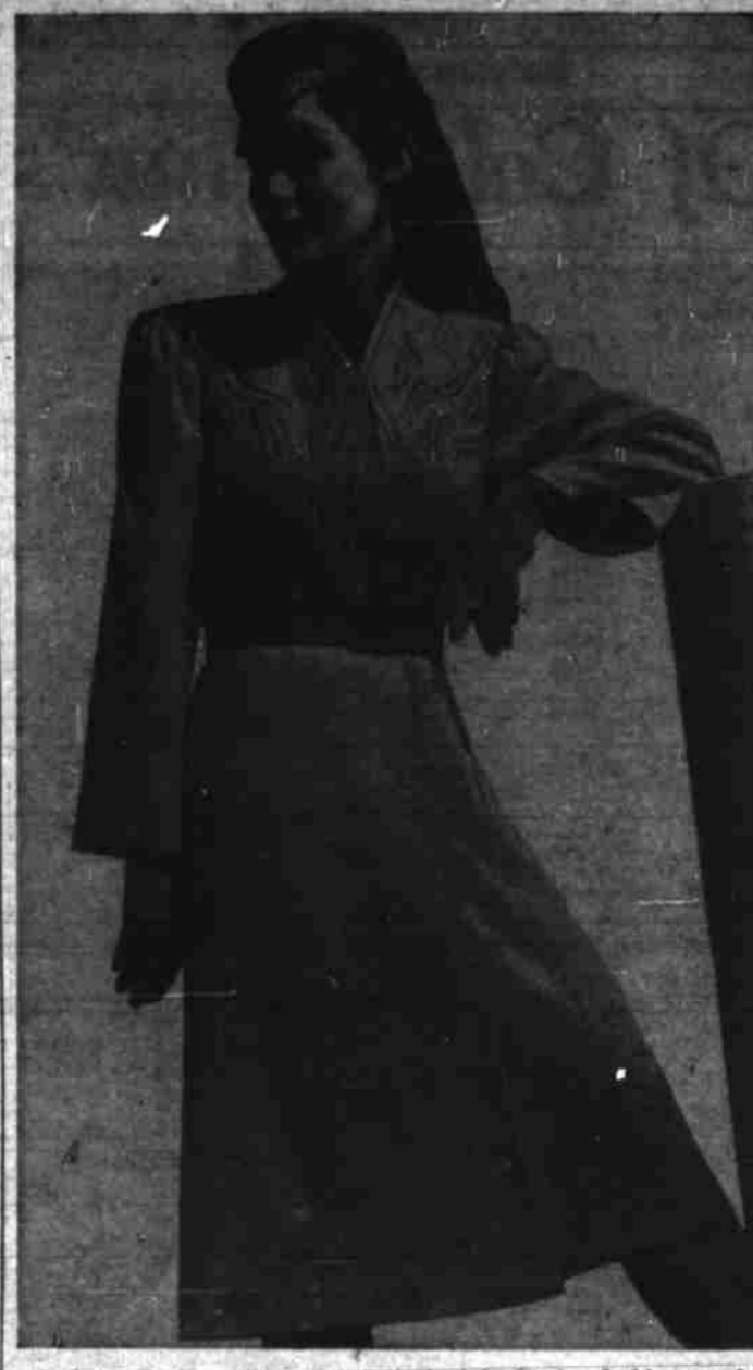
Beige and ginger tones are important in Easter fashion music. In this symphony are united a fitted coat of beige all-wool sub crepe quilted in leaf design at the collarless top. Scarf and belt are brown. The visored chapeau is of burnt toast straw swathed in a ginger chiffon veil.

checked wools (borrowed from the spring coat picture). The newest belle of 1910. Other skirt and are very fitted as to waist, full and jacket combinations link plaid or flared as to skirt and often soft, striped jackets to plain skirts or almost dress-like in design. Others reverse the formula. The skirts of-are slimmer and more tailored in ten show fullness—pleated or effect. Long box coats are being gored. Tailleur jackets are gored for mature figures over-ally fitted and longer (hiplength), blessed with avoirdupois and short while those that top frocks are box coats are new tricks displayed short—either snugly fitted (the for young slim women to wear favorite) or boxed. Redingotes are back in the Virtually none of them is furred.