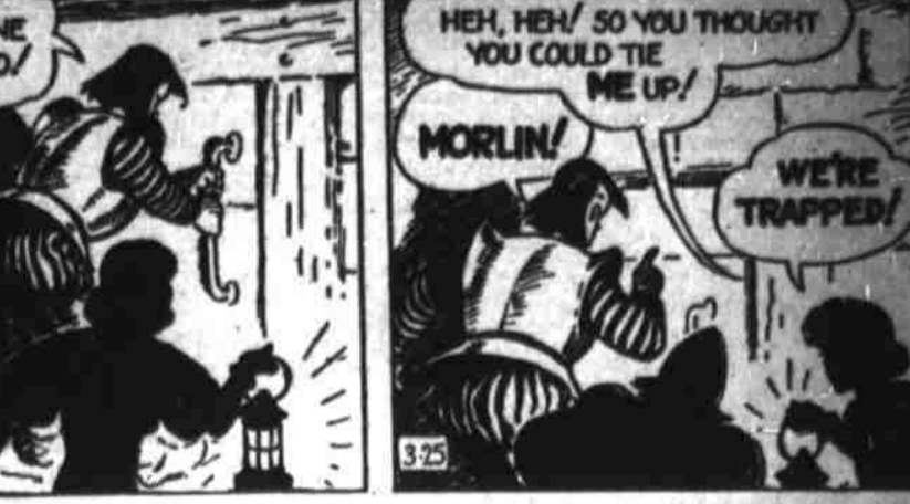
The Ghost Walks