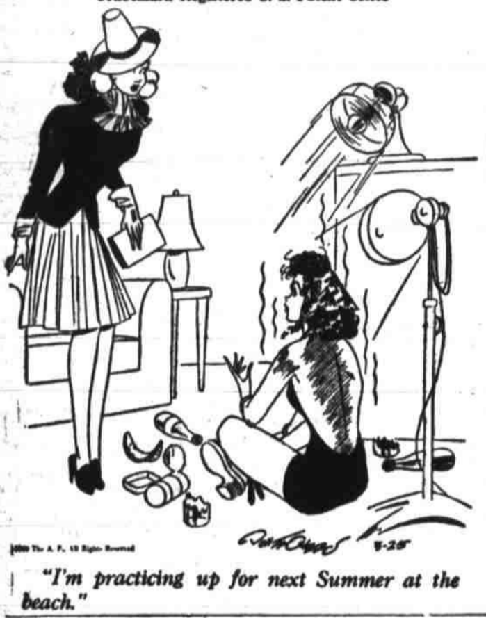
THE ADVENTURES OF PATSY