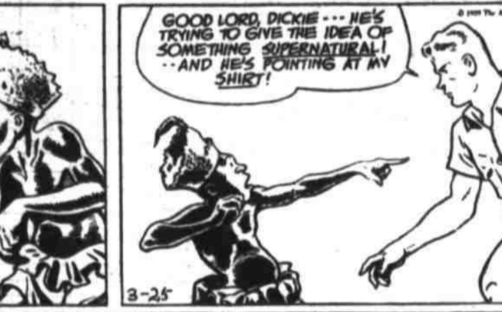
There's Always An Argument