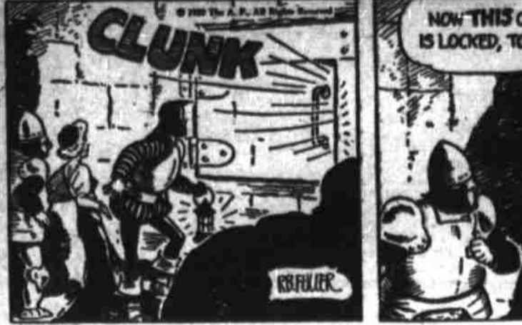
The Ghost Walks