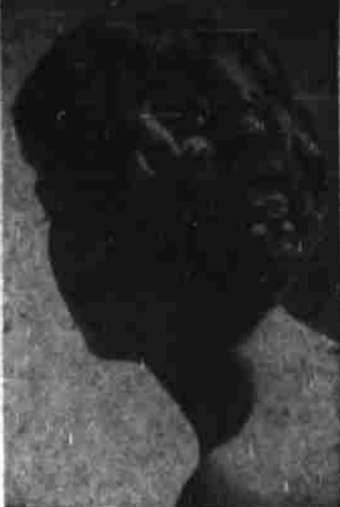
Because this hairline is somewhat irregular in back, the hair is dressed to cover it.

He has done quite a little experimenting with the line in back. Remembering that the shingle of post-war coiffures eliminated the problems of bad hairlines, he suggested an experimental shingle for