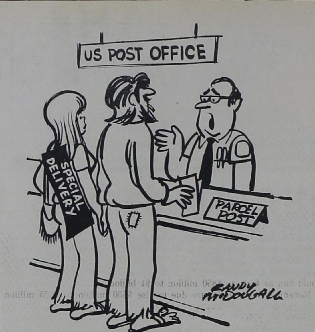
"I know the regulations say you can mail live chicks, but..."

-For turkey, cook to an internal temperature of 185 degrees F. Never partially cook and finish cooking later. On stuffing, do so right before roasting.