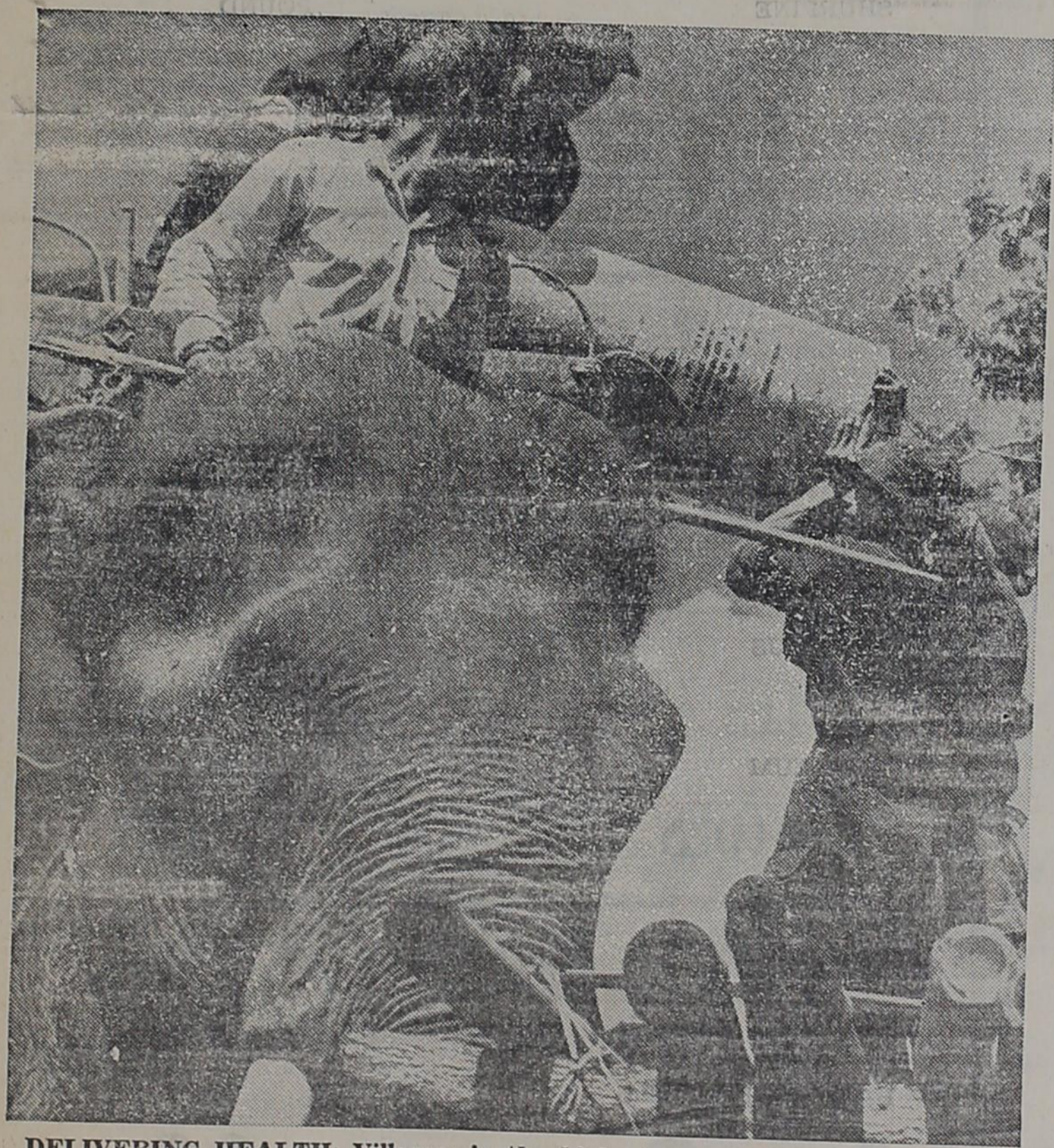
DELIVERING HEALTH: Villagers in the high plateau of Darlac Province in Vietnam are visited by a malaria eradication team carrying DDT and spray equipment. Close to 150,000 houses have been sprayed by Vietnamese civilians who were trained in malaria control methods by the U.S. Agency for International Development (AID).

COCKROACHES - Rats, mice, termites, gophers and other household pests exterminated. GUARANTEED. Davidson Pest Control, 111 First St., phone 894-3824. Leeland.