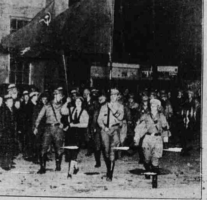
Demonstrators, such as those pictured above, were shunted into a side street in the outskirts of Washington, D. C., Monday night and held there through Monday morning as congress convened and they missed their intended march upon the capitol.