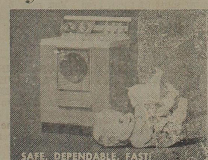
Live Modern for Less ...