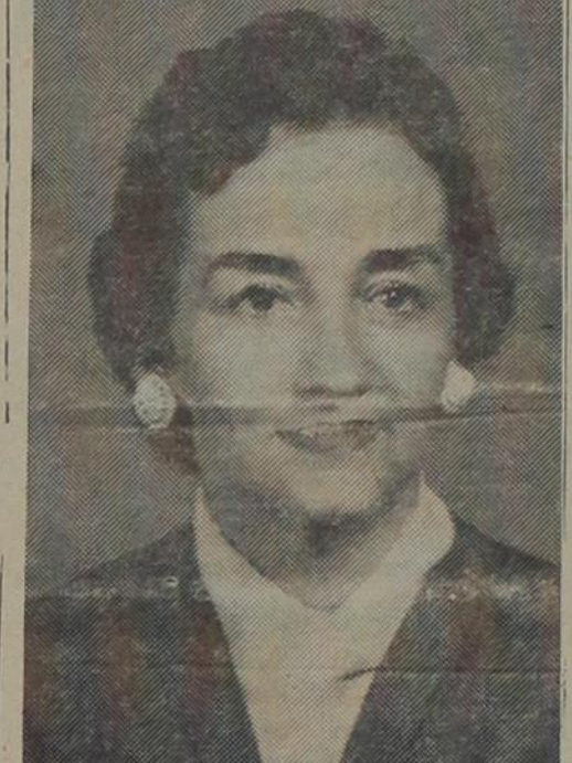
your District Clerk. Although I am unopposed

for relief of COLD DISCOMFORTS The STANBACK prescription type formula is a combination of pain refor FASTER RELIEF of HEADACHE due to colds. STANBACK also REDUCES FEVER. SNAP BACK with NEURALGIA and ACHING MUSCLES