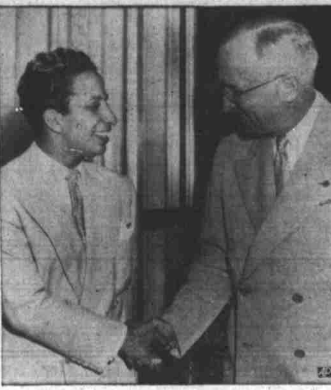
President Truman shakes hands with 17-year-old King Faisal II of Iraq at the White House in Washington for lunch. The boy king flew to Washington from New York. Washington is the second stop on his five-week tour of the United States.

High today 82, low 64. Tomorrow, mostly cloudy and mild. High 82, low 62.