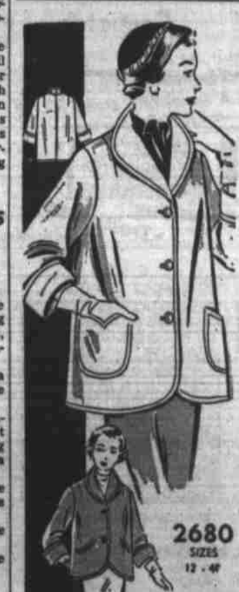
2680 SIZES 12-48