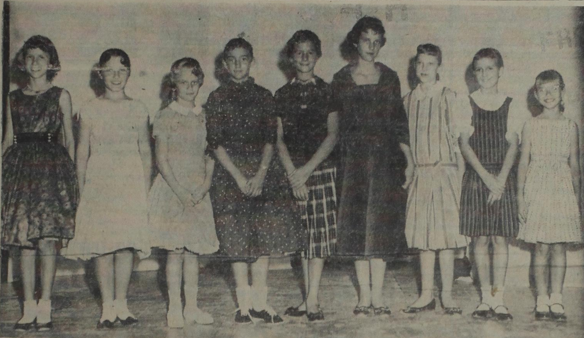
Blue ribbon winners from ages nine through 13 are shown above following the Hockley County 4-H dress revue. These girls won first

places on the basis of the construction of their dresses, selection of material and appearance of the garment on the girl. They are, from left