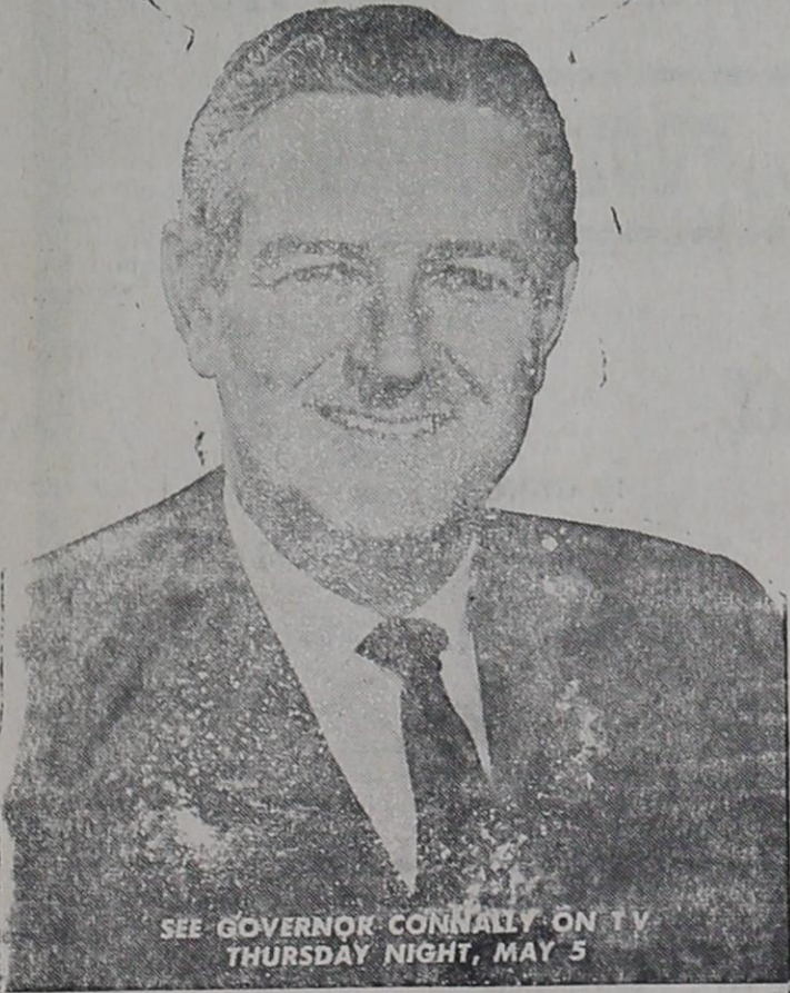
SEE GOVERNOR CONNALLY ON TV THURSDAY NIGHT, MAY 5

I am deeply grateful for your continued confidence. I hope that I may merit your support again on May 7th--both at the polls and at your precinct convention, to continue the important progress we are making together.