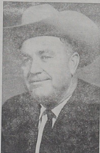
VOTE FOR WEIR CLEM For Re-election

CESSPOOL CLEANING $20 For Average Size CESSPOOL or SEPTIC TANK Septic Tank Service CHAPLIN SKUPIN, Owner BROWNFIELD