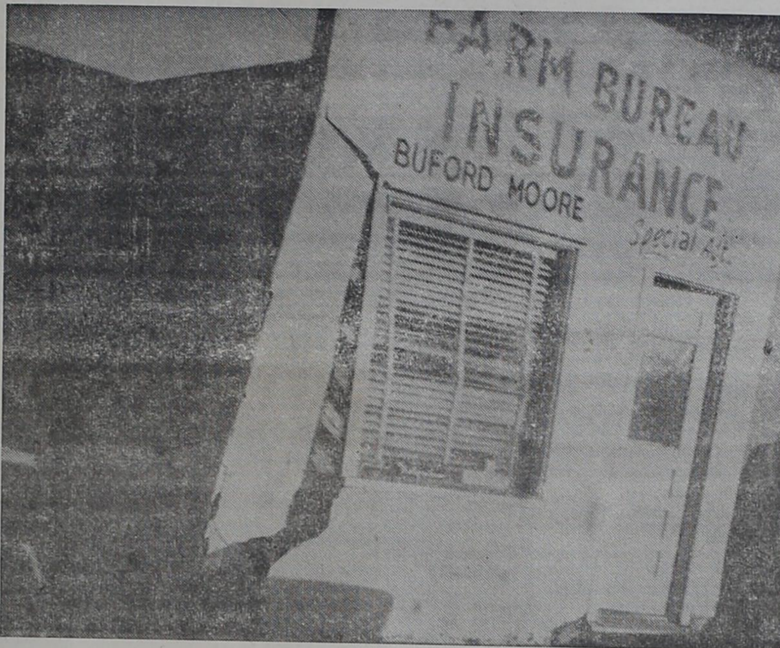
ABOVE — The opposite wall a large desk and filing cabinet had not been in the way. torn loose. That is where the car would have come out if Luckily no one was injured seriously.