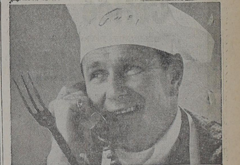
"She's right here on the patio with me!"

No more bothersome running in and out to catch the phone—not when you've got a portable phone or an extension on the patio. The last word in outdoor living—it costs so little. This year, get an outside extension in a color to match your summer furniture.