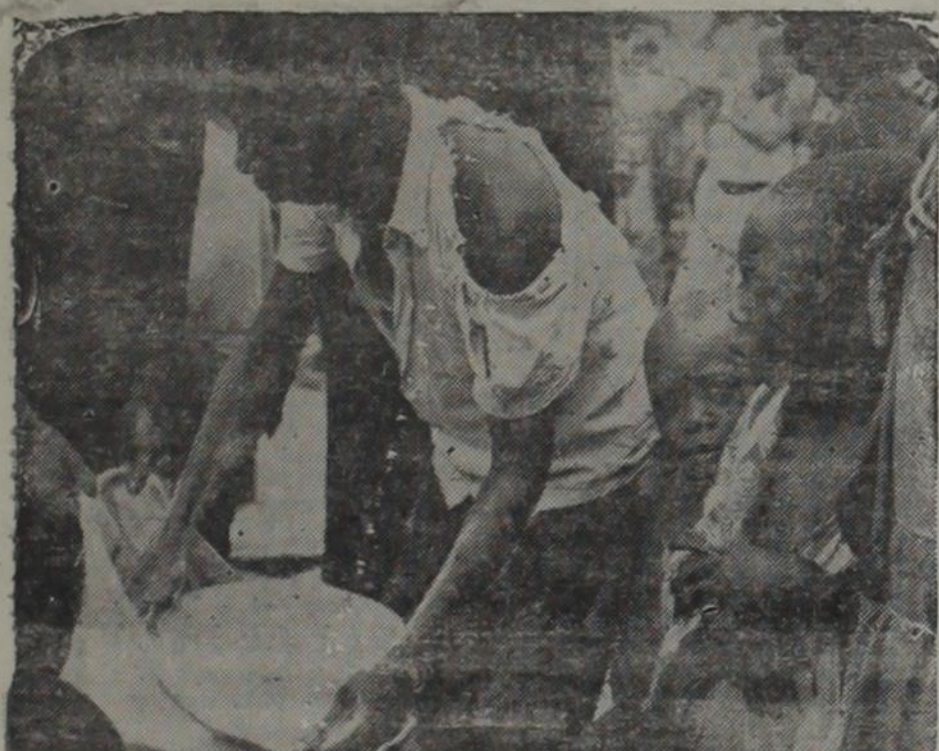
CROP started exporting food to the Congo as soon as trouble started in 1960. There were reports of more than 200 people dying of starvation daily at the end of 1960. The CROP foods, shipped through Church World Service, have been of great value in helping the people of this newly independent nation through a period of severe crisis. "Give us this day our daily bread," has great meaning for most Congolese, who look to CROP and CWS to help them stay alive.