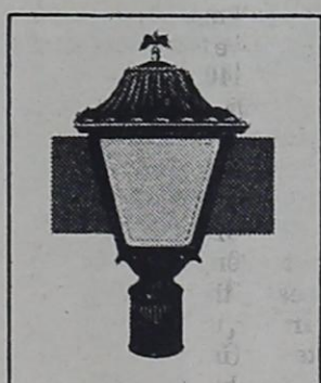
SENTINEL Antique Gold Matte Black Swedish Iron

■ NOW you have seven choices of attractive finishes ... in three different price ranges. Prices include photo electric cell, weatherproof outlet and installation. Ready-lites are versatile—change bulbs to color for happy holiday display ... plug in electric yard tools, barbecuers or Christmas decorations.