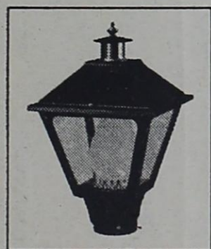
TRADITIONAL Black or White

A READY-LITE KNOWS DAY FROM NIGHT, AUTOMATICALLY