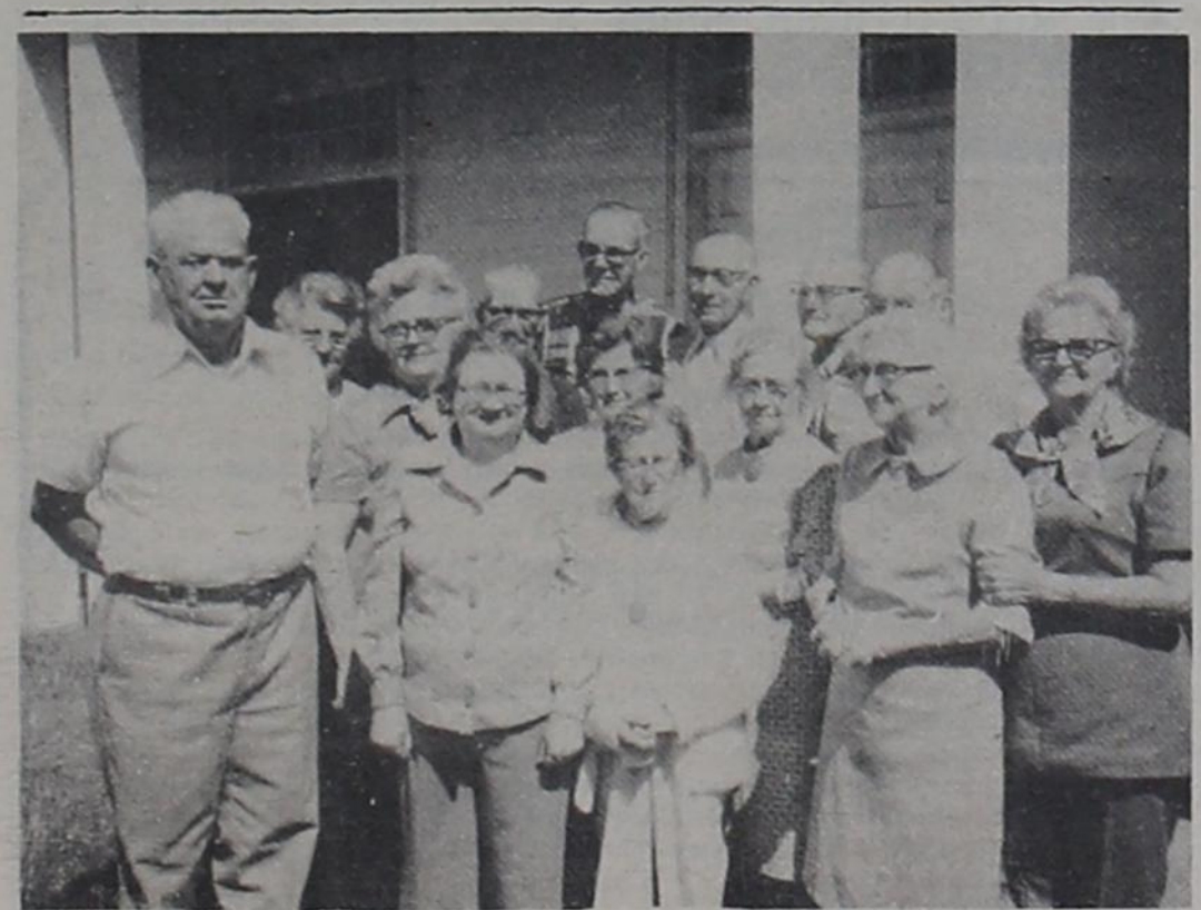
Senior Citizens from the Ropesville area had their monthly luncheon recently. The group, shown here, meets the first Wednesday of every month at the Ropes Community Club House.