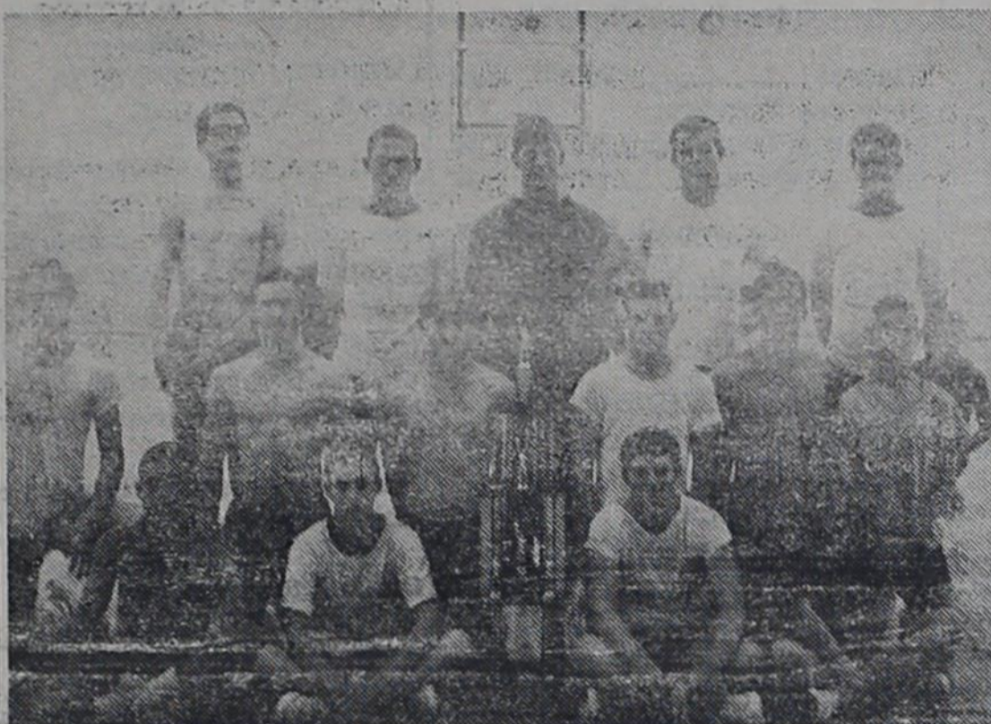
Pictured above are the boys on the Ropes High School A basketball team and the big first place trophy they won recently in the Whiteface tournament. Last weekend the boys won third in the tournament held at Meadow.