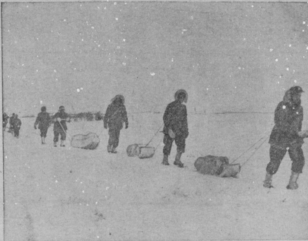
TRYING IT OUT —These are some of the 200 men of the Canadian Army who are testing new equipment in the region north of Edmonton, Alberta. They'll try out material which will be used in the forthcoming combined U. S.-Canadian "Exercise Sweetbriar" in the Yukon and Alaska along the Alaska Highway.

Guests were registered from Denton Valley, Leuders, Bowen, Caddo, Dallas, Cross Plains, Rising Star, Clyde, Abilene, Ran-