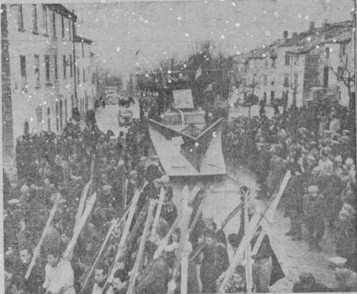
VILLAGERS WELCOME THEIR GIFT—Turning out for the arrival of an American snow plow, the residents of the tiny mountain settlement of Capracotta, Italy, give it a big welcome. The plow is a gift from the residents of Jersey City, N.J., and skiers from the town are leading the way toward a road in the Apennine Mountains where it was given a try-out.