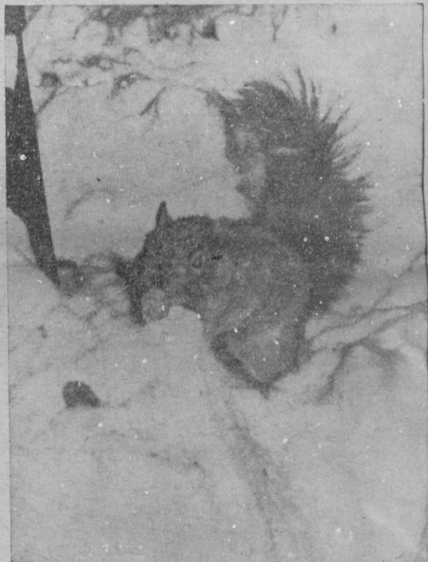
GOTTA WORK NOW —Most of the eastern winter has been mild, and this squirrel in Rochester, N.Y., is quite annoyed about an unexpected heavy snowfall. He thinks the cold is enough, but snow makes it awfully tough for a squirrel to find a living.

The average weight of the human brain is 4 ounces.