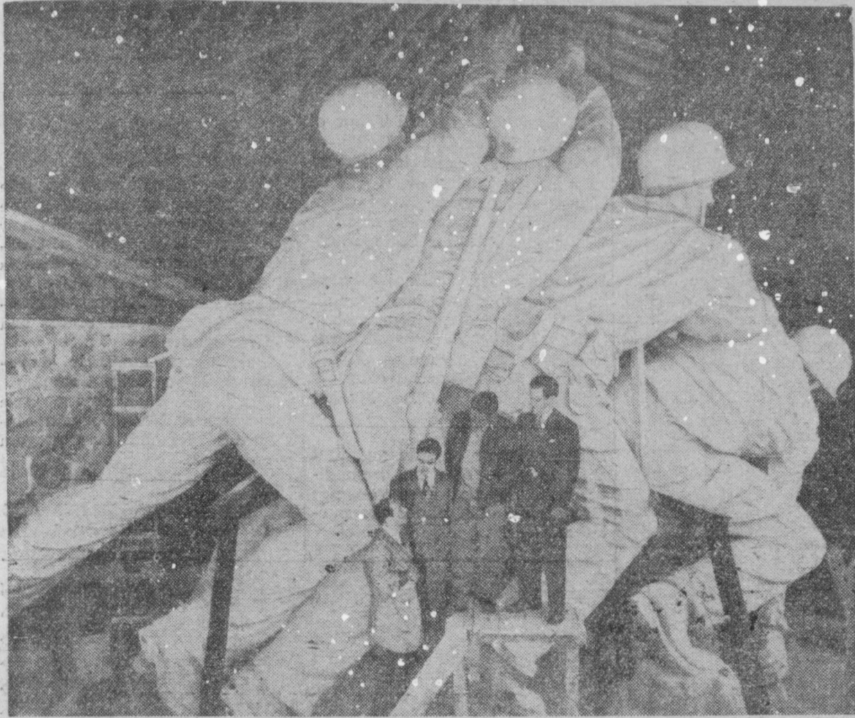
SEEING THEMSELVES—The three survivors of the five marines and one sailor who raised the American flag on Iwo Jima see a statue of the flag-raising in New York. The figures will be cast in bronze and placed by the Potomac River, near Alexandria, Va. Left to right are Felix De Weldon, the artist; Rene Gagnon, Hocksett, N. H.; Ira Hayes, Bapchule, Ariz., and John Bradley, Antigo, Wis.