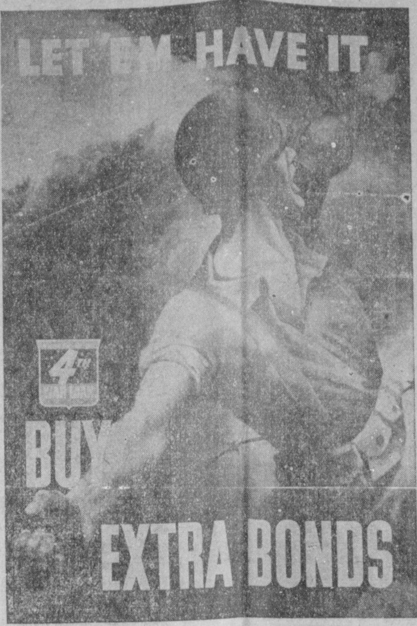
U. S. Treasury Department