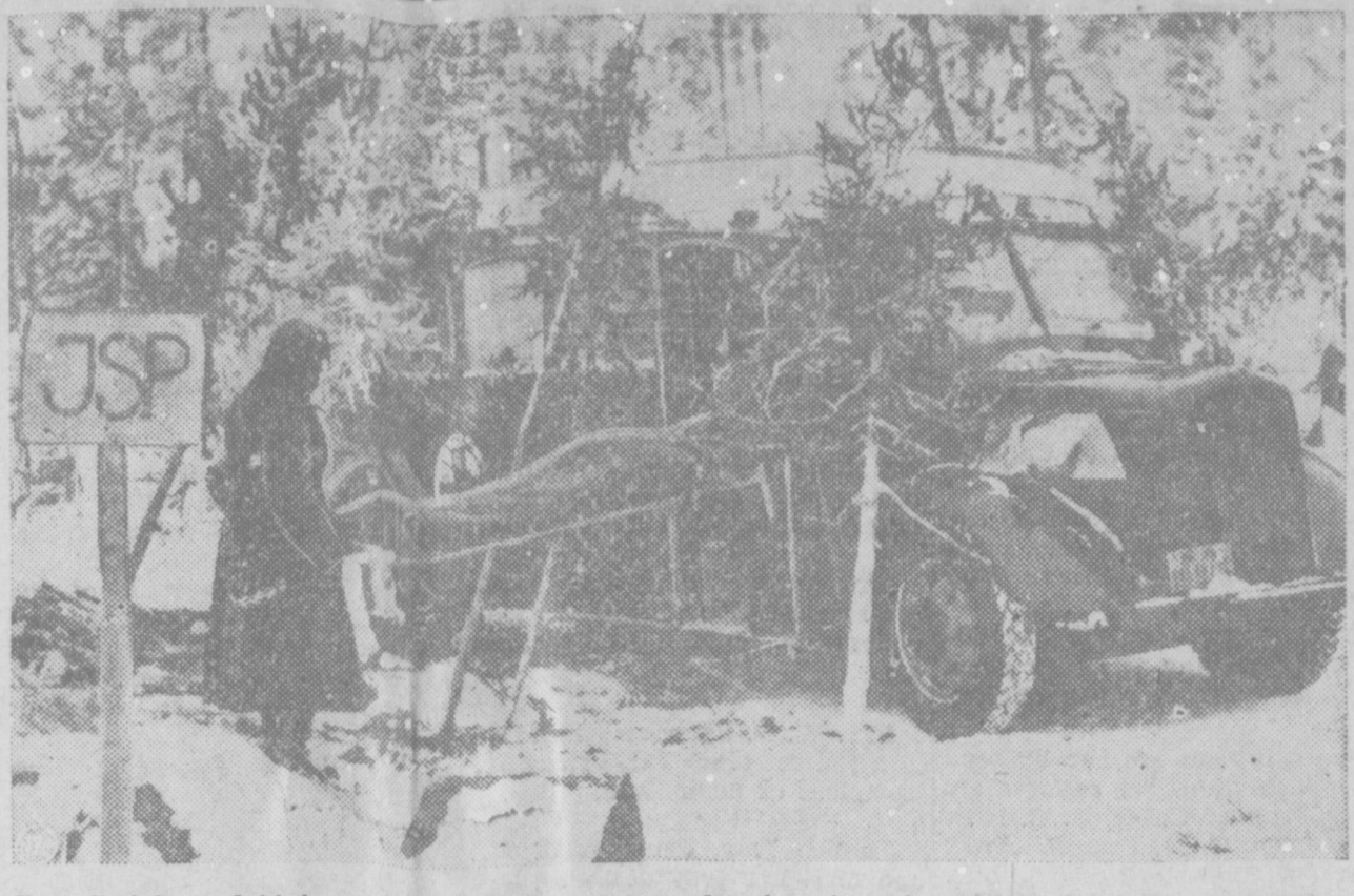
Even Red Cross field dressing stations must be camouflaged against air attack under rules of presentday warfare.