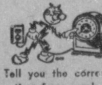
Tell you the correct time for a week.

THIS IS AN ANAGRAM. The four scrambled words tell a well-known truth these days of scrambled budgets.