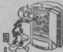
Protect your food for 5 hours, or