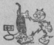
Vacuum clean 6 large rugs, or