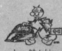
Iron 20 table napkins, or