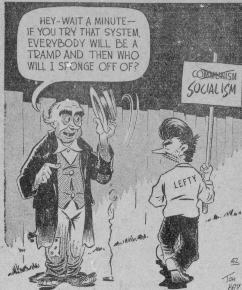
Even the Hobo Can't Be Fooled!