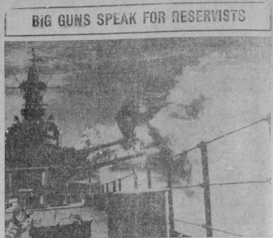
With hundreds of Naval Reservists aboard for a two-week cruise, the USS Wisconsin, Pacific veteran of World War II, demonstrates the might of her rifles as she plows over a peacetime Atlantic in the Navy's ceaseless program of personnel training. A participant in all the Pacific operations of 1945, the "Wiskey" has been one of the principal units employed for the schooling of Reservists since the end of the war.