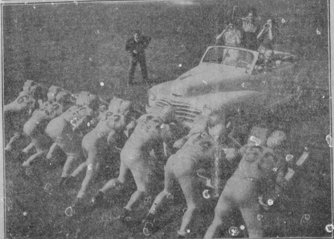
"Seven iron men vs. 90 horses" ... the forward wall inspiration. The un-harnessed practice session sought to discover whether the forward wall could "hold that line" against a Chevrolet. The Tartar line admitted they'd had a workout, but said they'd never faced prettier competition.