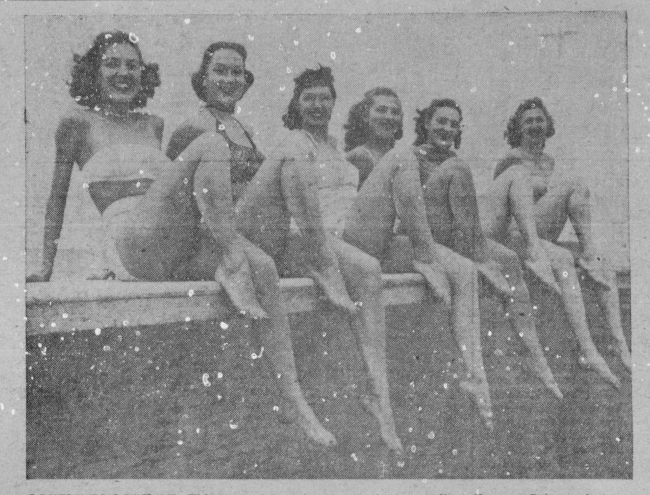
LOVELY TO LOOK AT-This bevy of beauties sits on the sea wall at Havana, Cuba, and cheers passers by with their mere presence. Such a cluster of loveliness isn't hard to take

The Executive Secretary reminsons fishing within their own ded anglers that the daily limits ty, provided they do not use are 15 large-mouth black bass, cial bait, and persons fish-small-mouth black bass, spotted of use either artificial bait Not more than ten of the black No black bass less than seven binches in length may be taken. Bids Sought On vithin counties adjoining the- bass or any sub specie of the means minnow or fish and than 11 inches. The limit is 25 cial bait is described as any for white bass, 25 for catfish and bid: ifactured bait or imitiation 25 for crappie and white perch