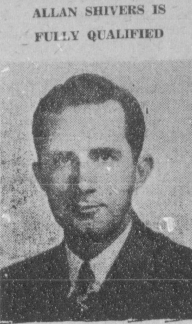
ALLAN SHIVERS IS FULLY QUALIFIED