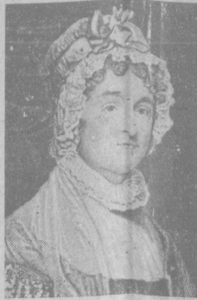
Abigail Adams, who had the unique distinction of being the wife of one President and the mother of another, John Adams, second President, was her husband, John Quincy Adams, sixth President, was her son.

On July 2, 1776, the delegates from the 13 colonies, meeting in Philadelphia, voted to separate from Britain. On that day, two days before the Declaration of Independence was signed, John Adams, later to become second President of the United States, wrote to his wife, Abigail: