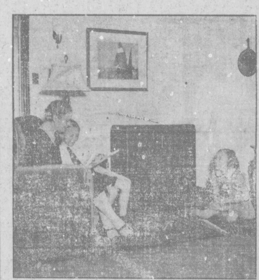
This sample photo shows a vented circulating gas heater in the home of one of our customers.

A prize of $10 will be awarded EACH of the TEN BEST PHOTOS submitted each week. At the close of the TEN WEEK PHOTO CONTEST four additional grand prices of $100, $75, $50 and $25 will be awarded the four best photos submitted.