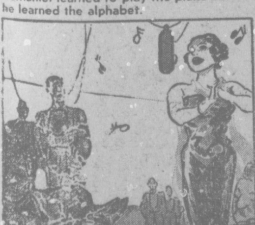
On January to, 1515, he organized and the tiest great symphony orches. to busedoest with John McCormack and Lucragie Sort na rolaiska!