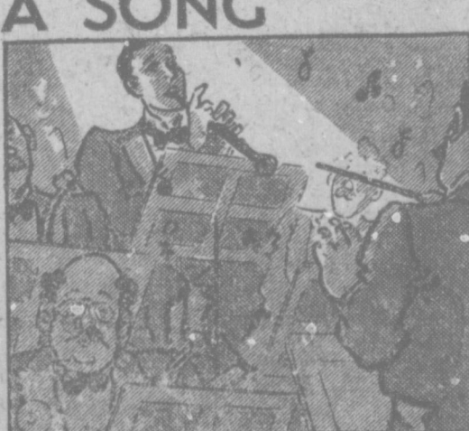
For six years he travelled as a child prodigy. When he reached the age of thirteen he began to play with major symphony