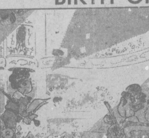
By the time he was six, he had switched to the clarinet and had become reloist in a children's orchestra of seveni; places.