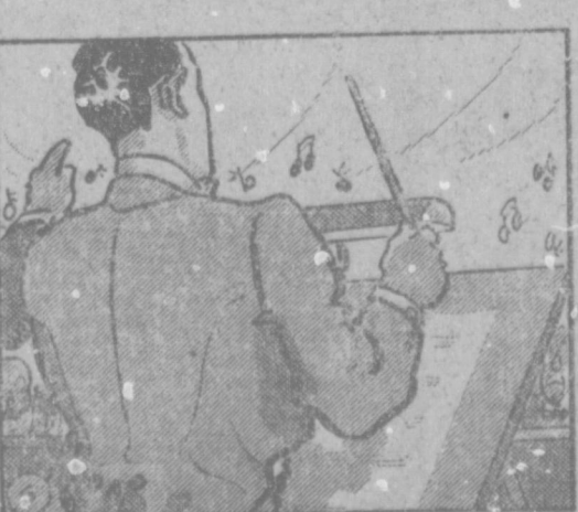
He kept right on conducting radio concerts, sometimes leading as many as ten in a veck with all the details of rehearsals and other duties.