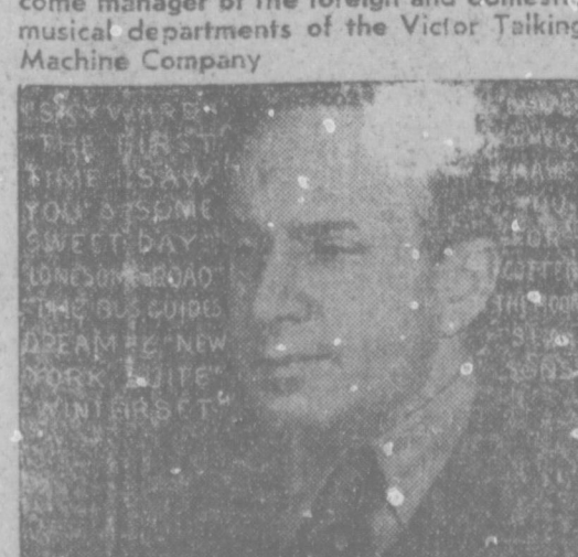
His original copyrighted works earned him membership in the American Society of Composers, Authors and Publishers, which ticenses their use in public performance for profit and protects them against