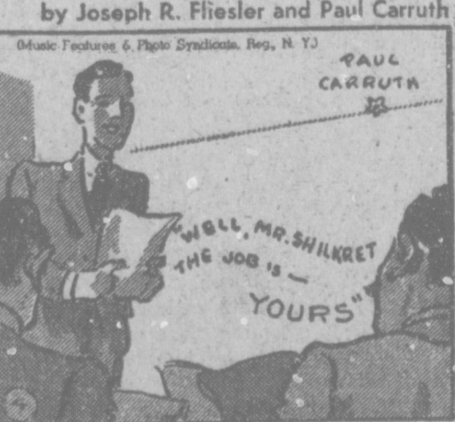
By the time he was twenty, he had become manager of the foreign and domestic musical departments of the Victor Talking