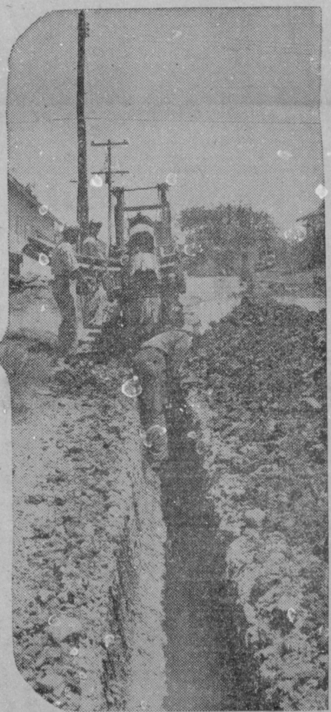
Ditching machine is major unit of highly mechanized teams who build new distribution lines in towns and cities on Lone Star Gas System.

In 1947, the first year of our current Five Year expansion program for which $40,000,000 will be invested, Lone Star Natural Gas distribution plants were completed in Chandler, Brownsboro, Caldwell, Farmer's Branch, Pottsboro, Thorndale, Bogata, Eustace, Novice, and Killeen, Texas. This one phase of our extensive expansion program brought Lone Star natural gas service to 1,981 homes. These homes can now enjoy more healthful living and many conveniences for an average cost of less than fifteen cents a day. In 1948 we hope to build more than double the number of new town plants built in 1947. New town plants, new pipelines, new compressor stations, thousands of service lines for new customers, new gas wells—and many other things new, are our work to keep abreast of the demand for more natural gas in the 325 growing communities we serve.