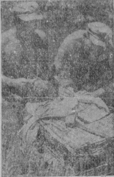
American soldiers in the Admir- alty Islands write a message and at- tack the container to the leg of a carrier pigeon. The pigeon "air force" does an invaluable job in communications in the difficult kind of warfare we are up against in the Pacific. Your War Bonds helped to train this "air force." Keep up your Bond purchases until G. I. Joe reaches Tokyo. U. S. Treasury Department