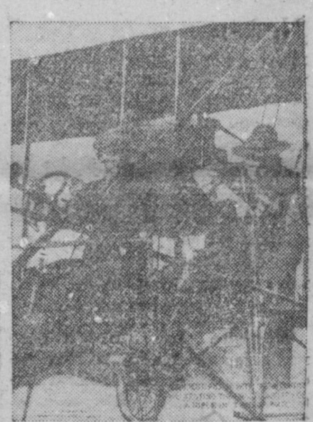
"Modern Warfare" 1910-A photo showing Glenn Curtiss piloting the first U.S. "armed" aircraft.