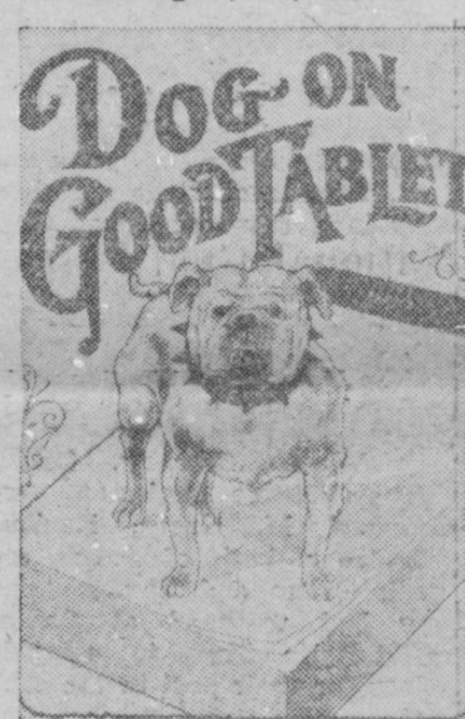
Puns of doubtful quality have always been with us. Here was a funny one in 1900. Old tablet tops are now collector's items.