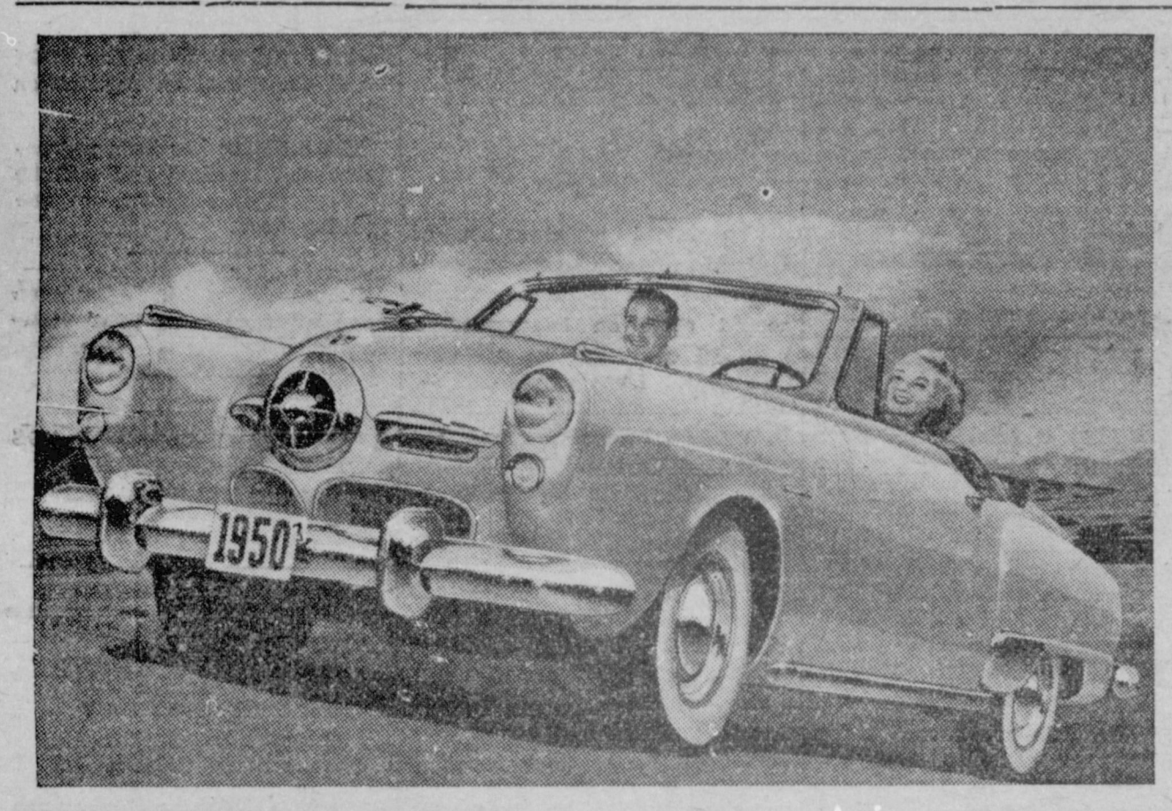
New power, speed and sleekness are expressed in the advanced design of Studebaker's 1950 passenger car models. Embodying a complete change in frontal appearance and fender treatment, these cars designed by Raymond Loewy Associates appear to be in motion even when they are standing still. Shown here is the 1050 Studeboker Commander convertible.