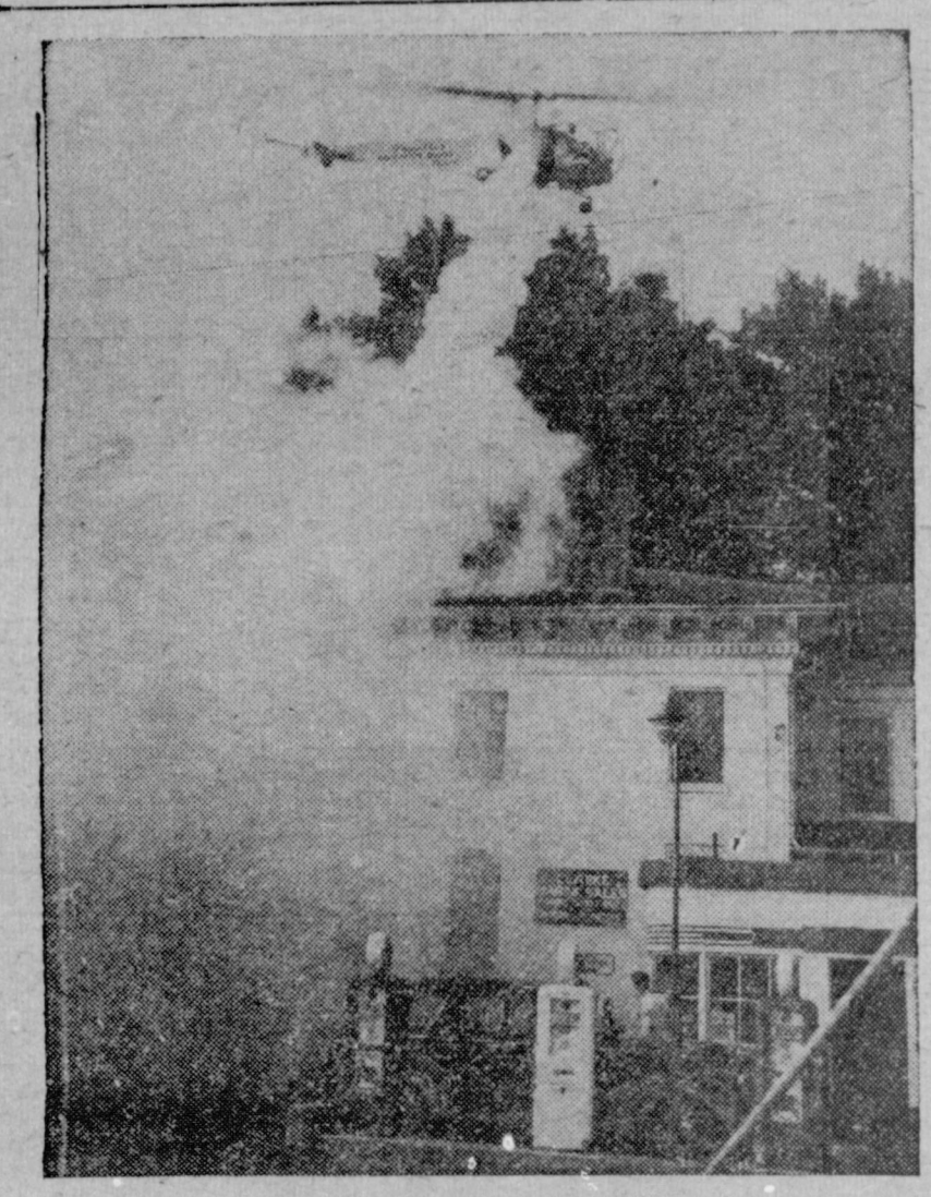
AIRBORNE POLIO FIGHT-A helicopter, skimming along at tree-top level, sprays DDT-laden aerosol fog over Springville, N.Y. To fight polio, the aerial spray gun is a ming at eradicating flies and mosquitoes from the town and surrounding area.