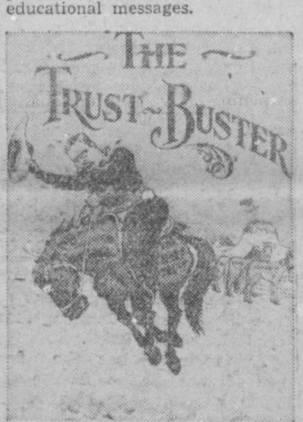
Circa 1906—The immortal Teddy Roosevelt Subdues Monopoly.

Tablet covers shown here were collected from old established companies still in business, among them the firm founded by the inventor in Pennsylvania. Today, these school necessities are sold in the multiple millions all through the year and are as widely used in the nation's remaining 75,000 one-room schools as they are in the modern consolidated districts. Only a few slates are still in use. Today's tablet tops reflect current interests. They are likely to picture movie stars, the latest airplanes, often conservation or