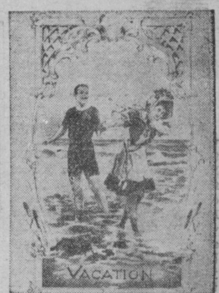
1892-This ore was considered "very daring" for small children.

This tablet top, in use 1885-1911, did not sell well at first, as merchants thought slates could not be replaced.