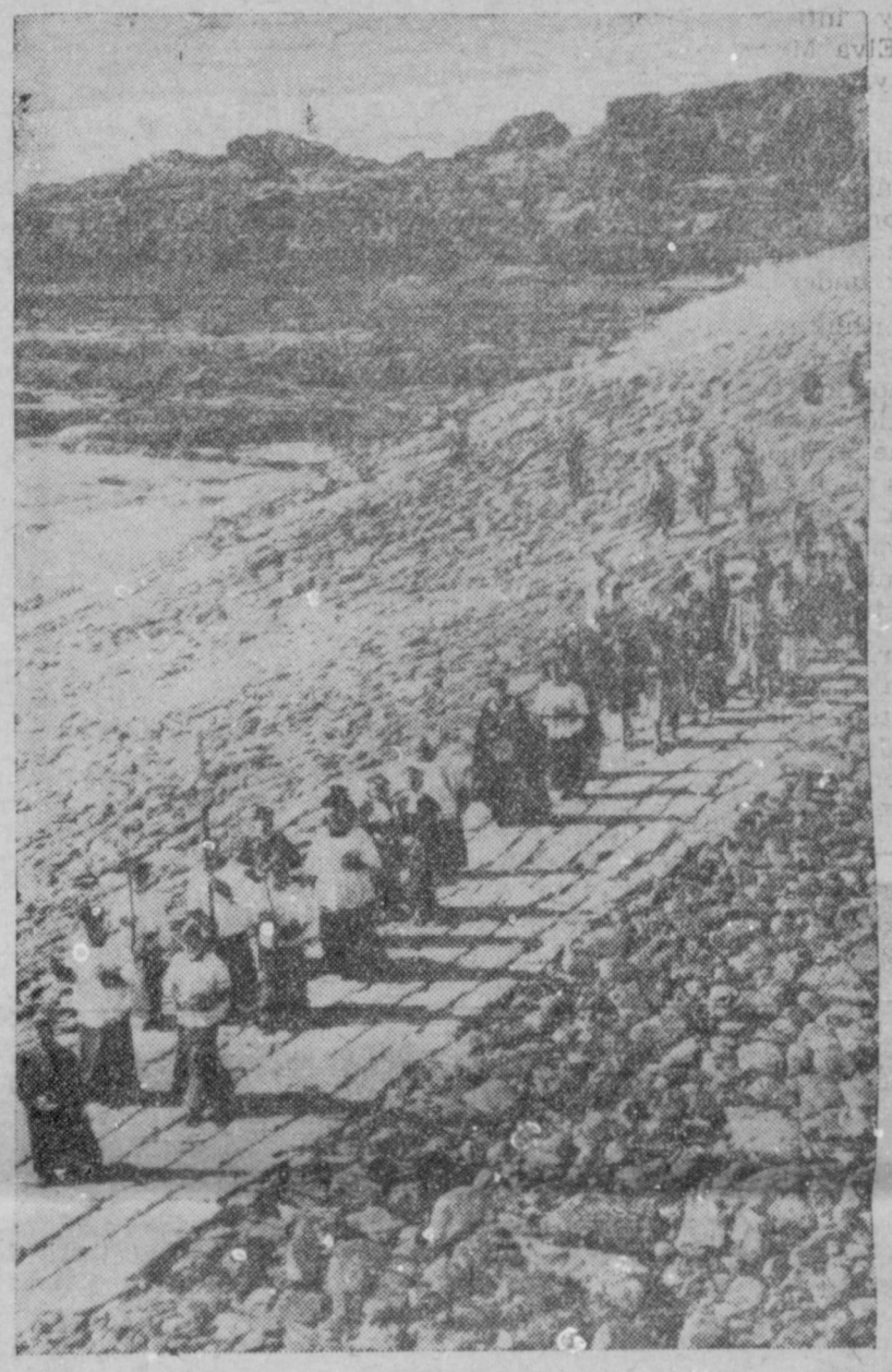
DOWN TO THE SEA-Village folk march in procession along the old breakwater at the little Cornish Ashing port of Bude, England. Occasion is the centuries-old "Blessing The Sea" ceremony held on the site of the Cld Chapel Rock.