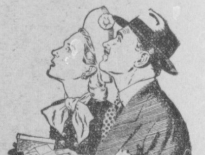
MR. & MRS. PASSENGER