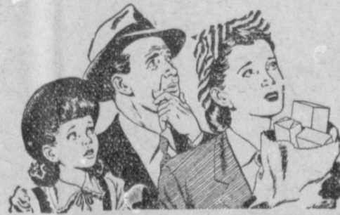
MR. & MRS. CONSUMER