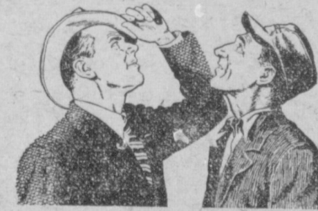
MR. SHIPPER & MR. FARMER