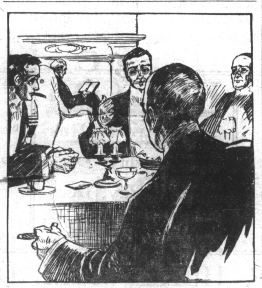
WOULD HAVE HIM BOUND AND GAGGED AND THROWN INTO A SEDAN CHAIR.

"It is not a taste, it is his vice," returned the gentleman with the pearl stud. "It is his one dissipation. He is noted for it. You, as a