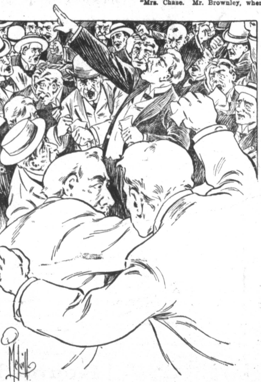
He Seemed Absolutely Unmindful of the Agonizing Shriek About Him.