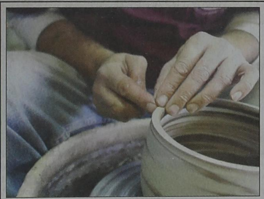
The potter's hands molds artistic life in black and white clay.