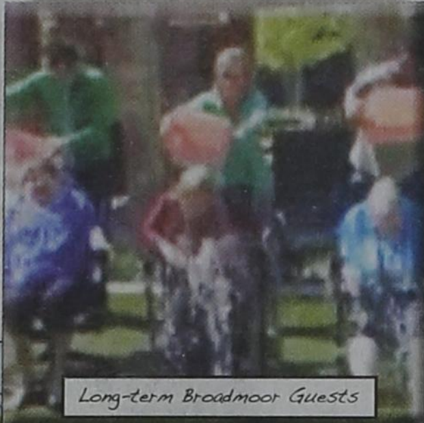
Long-term Broadmoor Guests