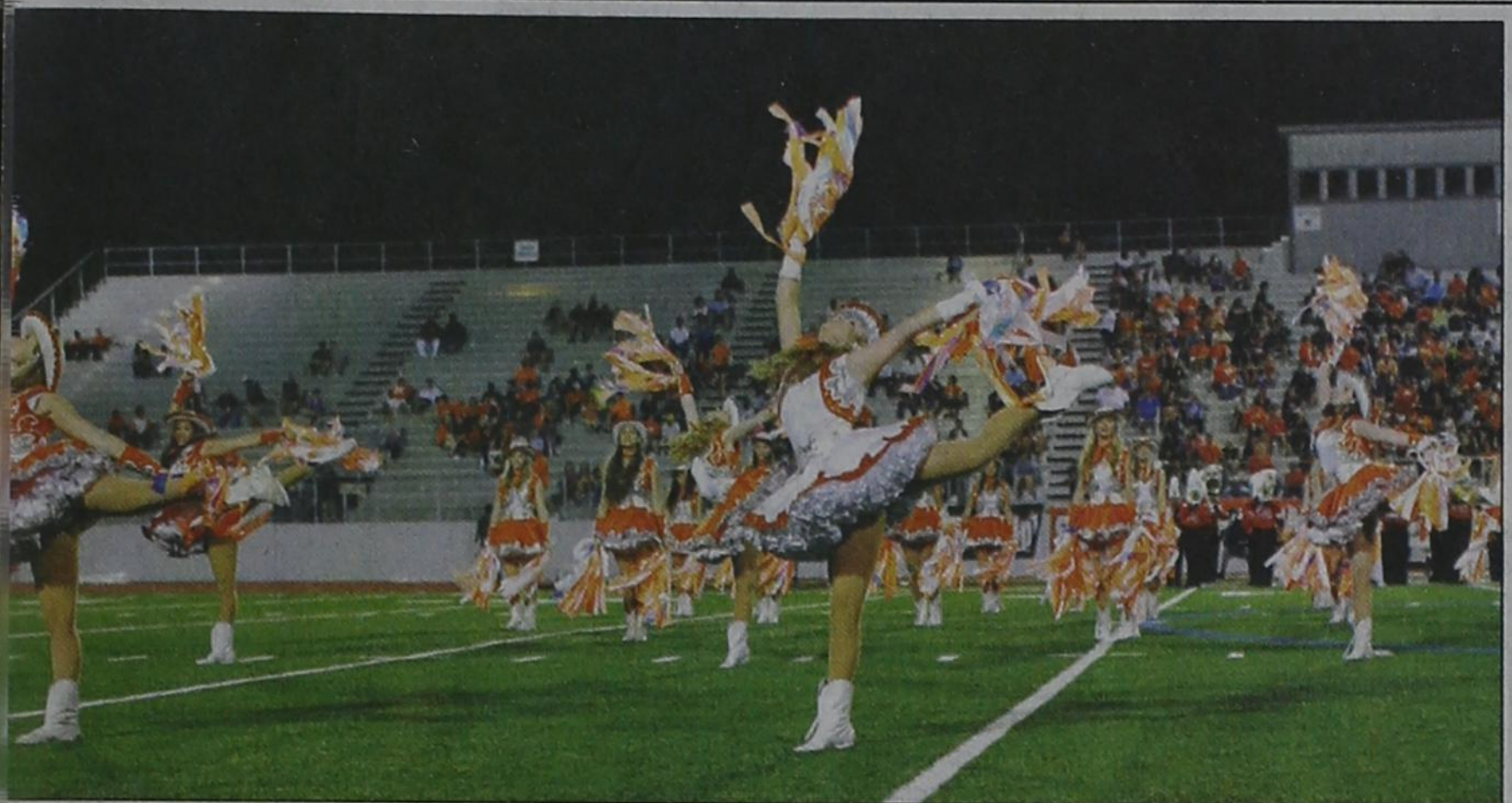
Rockwall High School Stingerettes perform a dazzling routine on Thursday Sept. 18, during the halftime of the game between the Yellowjackets and North Garland at Wilkerson-Sanders Stadium in Rockwall.