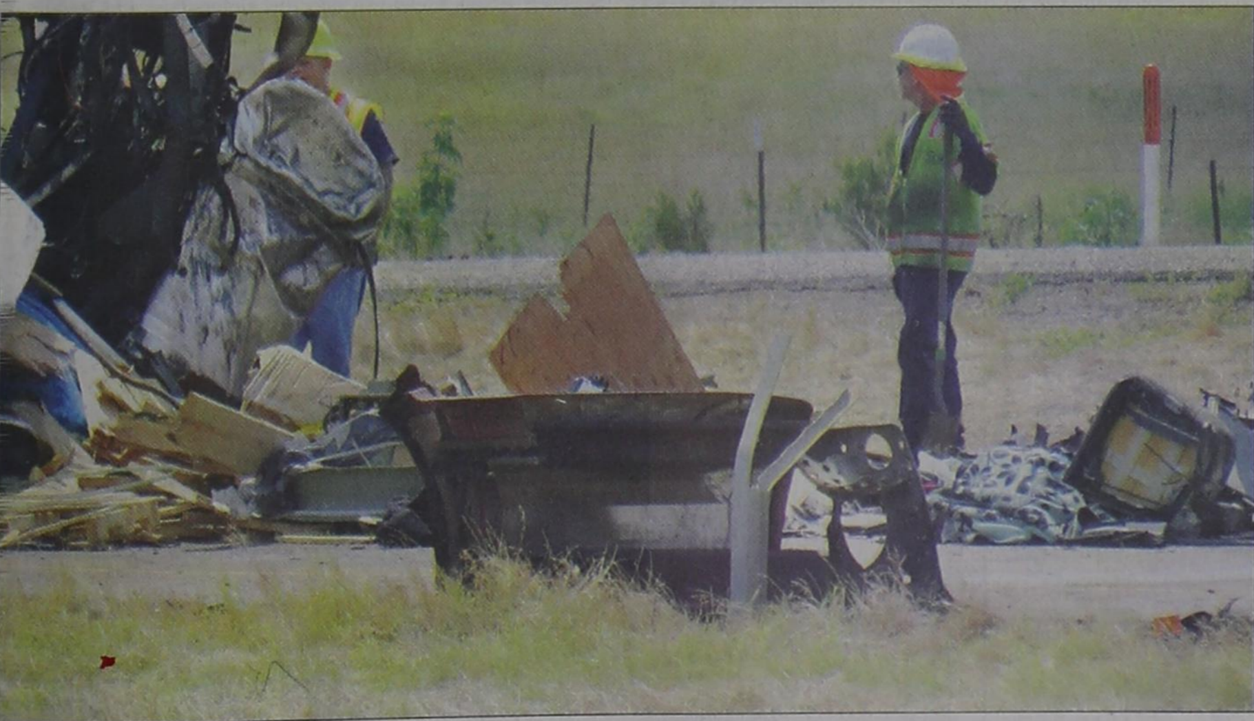
An accident in Royse City that resulted in the deaths of three people shut down the eastbound lanes of I-30 for more than 12 hours on Friday, June 29, and rerouted traffic for miles all day.

The book is being published by Workman Publishing. Illustrator is also from Brooklyn.